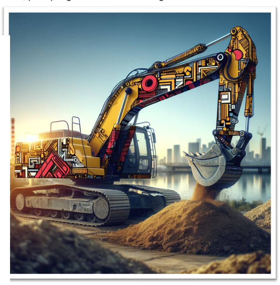
Al Generated Representative Image

Tata Hitachi has raised concerns about the growing Chinese imports affecting Indian construction equipment companies. The company's market share has dwindled, leading to calls for government intervention to protect domestic firms. Despite a strong market, imports cap growth, prompting a focus on technological advancement.