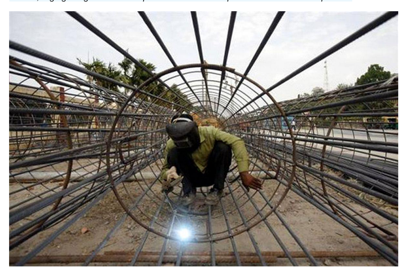
Illustration: Dominic Xavier/Rediff.com

Tata Hitachi expresses concern over rising Chinese imports in the Indian construction equipment market, urging the government to protect domestic companies from 'unfair' competition.