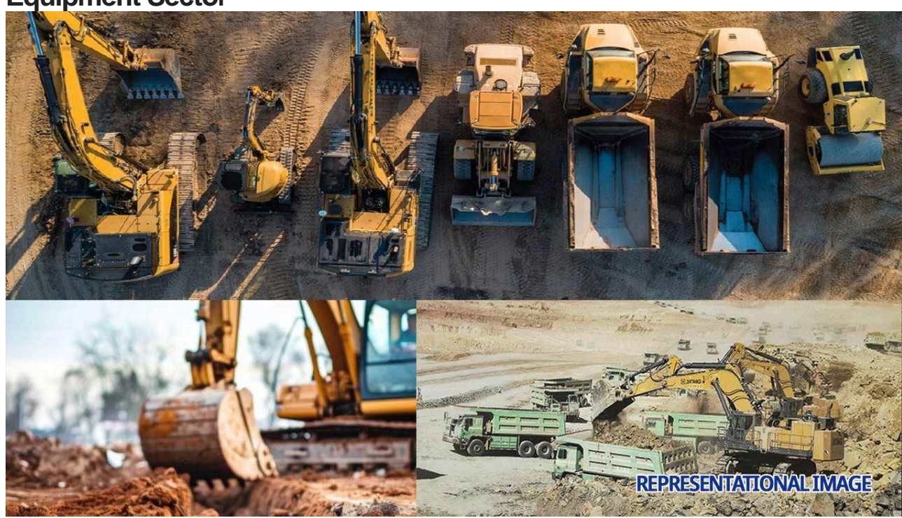
Rising Concerns Over Chinese Competition in India's Construction Equipment Sector

New Delhi, Oct 24 (KNN) In recent developments, Chinese companies have significantly increased their share in India's construction equipment market, climbing to 22 percent. This surge has raised alarms among Indian manufacturers, particularly Tata Hitachi and BEML, who have expressed concerns regarding the impact of low-cost imports from China on their businesses.