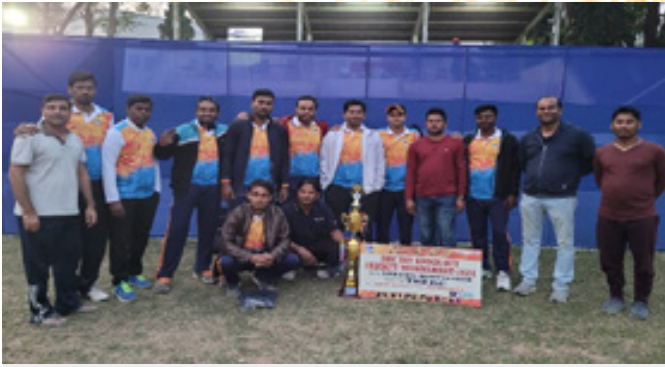
Tata Hitachi secured runners up position in the cricket tournament organized by Tata Bearing on 11-02-2024