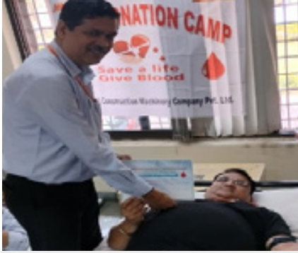
A blood donation camp was organised at the Kharagpur Plant on 1st March, 2024,