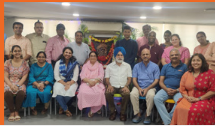
Corporate employees paid homage to in commemorating the 185th anniversary of Tata Group Founder, Shri Jamsetji Tata on March 3, 2024.