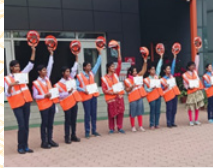
4th Batch of Excavator Operator Training Program was conducted with 31 trainees in February 2024.