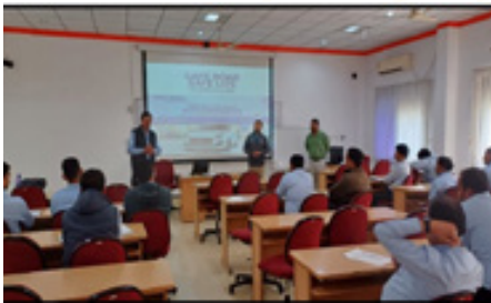
By Maruti Suzuki

Road safety awareness training sessions were organized by Maruti Suzuki & Tata Motors on 12.01, 15.01 & 16.01.2024. On 13.01.2024. These training sessions were organized for contract workers by EHS team. Total 137 participants attended these programs.