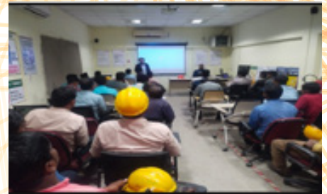
By Tata Hitachi EHS team