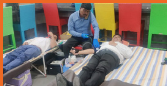
Blood Donation Camp was organized at Corporate Office in collaboration with Indian Red Cross Society