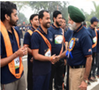
MD personally greeting each participant with a handshake

On 26th January 2024, The Ekiden marathon, Republic Day, and Family Day festivities were celebrated, further enhancing the spirit of unity and dedication at our manufacturing facility. Our employees, alongside their families and children, exhibited remarkable enthusiasm throughout the celebrations. Here are few glimpses.