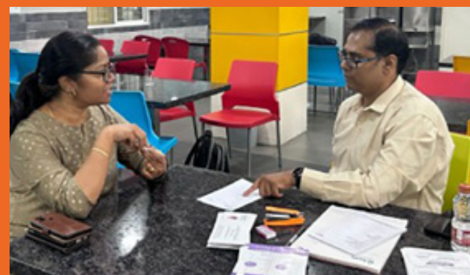
Basic health screening camp was organized at Corporate office through our Insurance Service provider in collaboration with Fortis Lafemma Hospital on 14th March 2024 which included Height, Weight, BMI, BP, RBS and Doctor consultation.