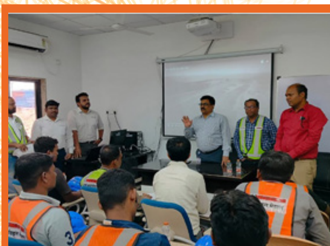
Empowering Excellence: Operator and Maintenance Training Program conducted at Llyods Metals and Energy Konsari steel plant