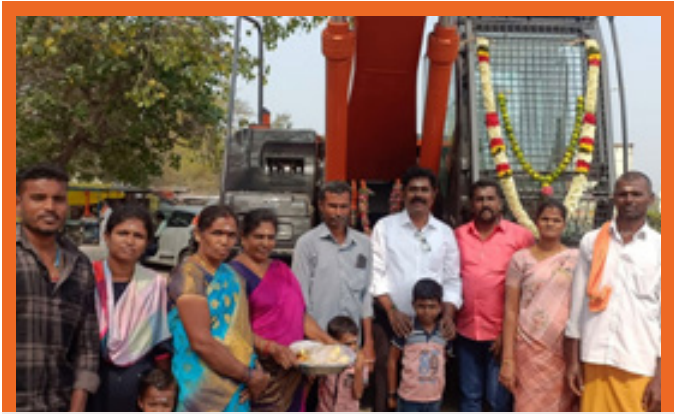
Delivered 1 unit of ZAXIS220 GI to M/s. Amman Hydraulics, Erode