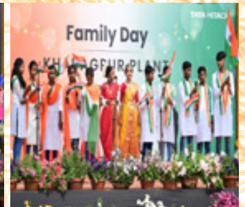
INSPIRE Kids Performance