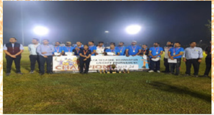
Congratulations to Hex & Wheeled Department for clinching the victory in the inter-department cricket tournament, with Paint Shop securing the runners-up position