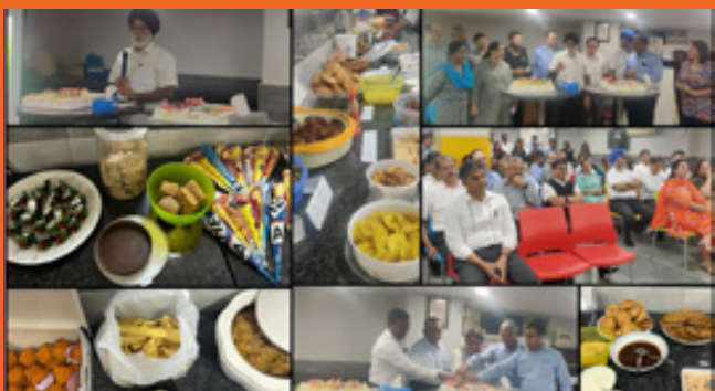
Spicing up the new year with love and flavor! January's monthly get-together was a potluck celebration featuring the diverse and delicious regional cuisines of India