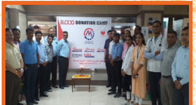
Blood Donation camp at CWH Nagpur, was organized in collaboration with M/s Swetal Logistics.