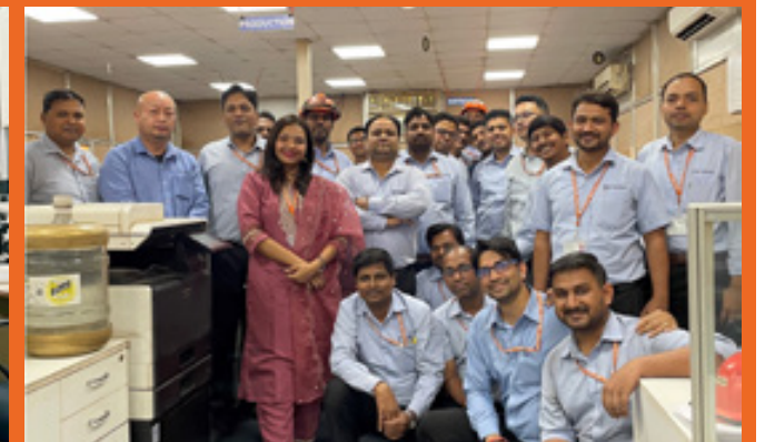
Women's day celebration at Metallurgical Lab and Transmission shop, KGP