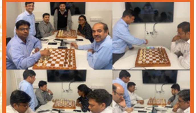
Indoor Sports Tournament - Chess