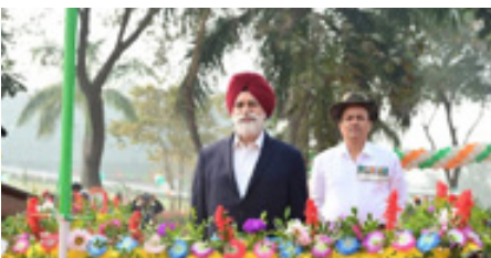
Republic day celebration