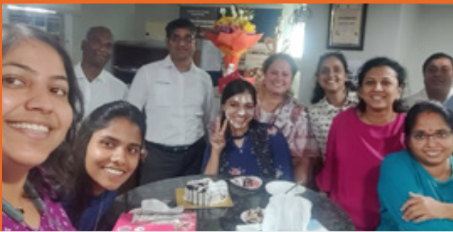
Celebrating Birthdays of HR, Admin, and MD Office Employees