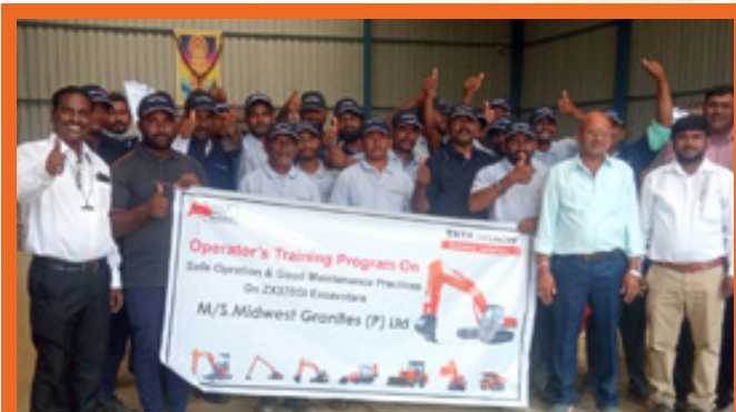
Operator training programme conducted at Midwest Granites in Kodad, topics covered were safe operations and maintenance