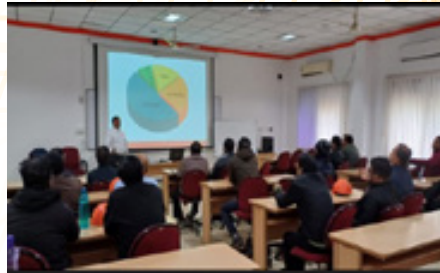
By Tata Motors