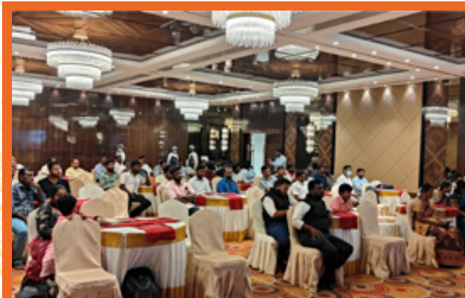
PPS Motors Private Limited, Salem conducted SHINRAI Customer Meet at Salem.