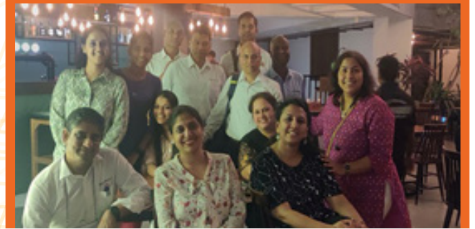
Gathering Under the Milan Scheme: HR, Admin, and MD Office Teams Enjoy Dinner Outing!