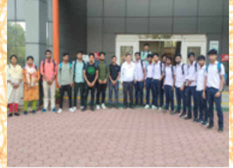
5th Batch of Excavator Operator Training Program was conducted with 18 trainees in March 2024.