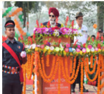
MD addressing the crowd.