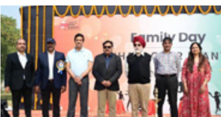
Family day celebration