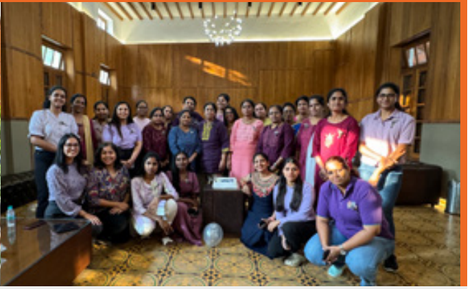
Empowering women! Celebrating International Women's Day with our incredible teams from Corporate HQ to Bengaluru Regional Office