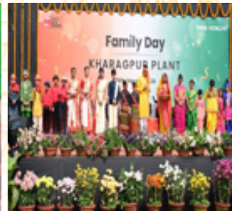
Employee Wards Performing on SHADES OF INDIA