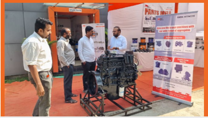
SS Excavation and Central region promoting awareness on RECON and REMAN solutions to customers

A comprehensive machine comparative study between SHINRAI Prime and JCB ECO Expert was conducted by Time Equipment at the Ashok Malik Site in Ballabhgarh, Haryana.