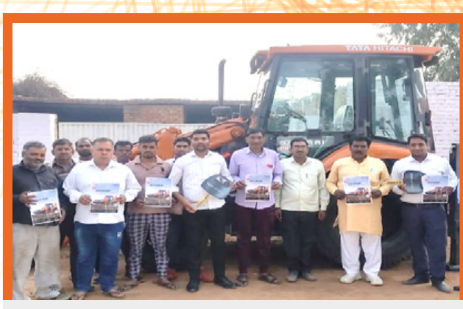
Customer meet conducted at Baghpat