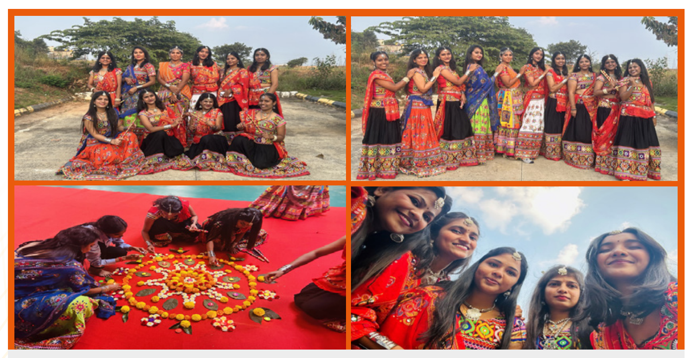
Navratri joy unfolds with a festive lunch, sacred pooja, and lively Dandiya dance, creating vibrant memories for employees at STC Dharwad on 20th Oct 2023.