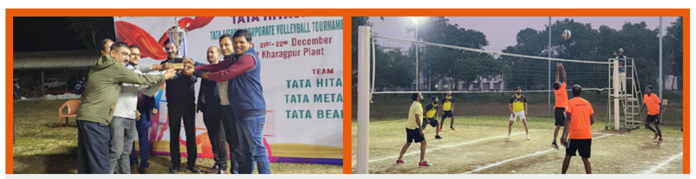
The Tata Hitachi Cup, a corporate volleyball tournament, showcased spirited competition among Tata Hitachi, Tata Metaliks, and Tata Bearings Ltd on December 21st-22nd. Congratulations to Tata Metaliks for securing the overall victory, with Tata Hitachi earning the well-deserved title of First Runner-Up.