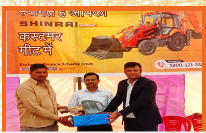
SHINRAI Prime Key Handover AT Hathras

EX 130 Prime Machine Handing Over At Jhajhar