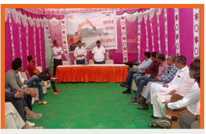
Customer Meet conducted at Jhajhar