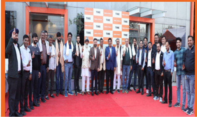
ASC Star Customer meet at Head Office Faridad