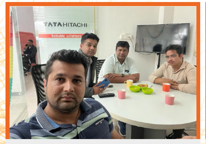
Loan Mela With Indusind Bank at Rohtak, Branch Office by Time Equipment Pvt Ltd