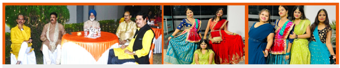
Few glimpses from the event