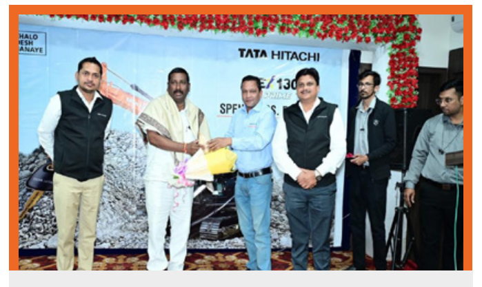
Key handover of EX 130 Prime to M/s. Aditya Stone Crusher, Washim.