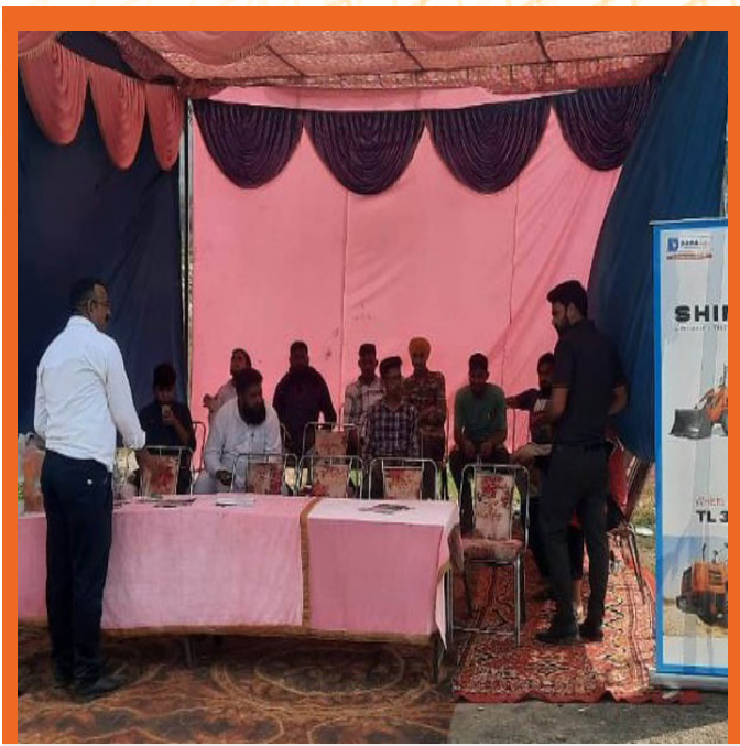
Customer meet and machine display conducted at Burjkotia, Panchkula, Haryana