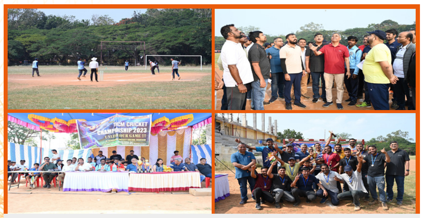
Employees showcased their cricket prowess in a spirited tournament held on November 18th and 19th at the Agricultural University playground.

KTEG representatives conducted a thorough exploration of the Dharwad Plant facilities, encompassing CED paint shops, fabrication, wheel assembly, midi assembly lines, warehouse, and the OTC Training Centre. The visit aimed to assess the feasibility of importing Mini models for the European market.