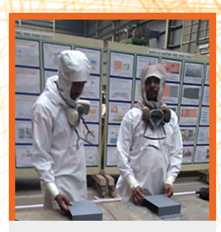
See and measure competition.