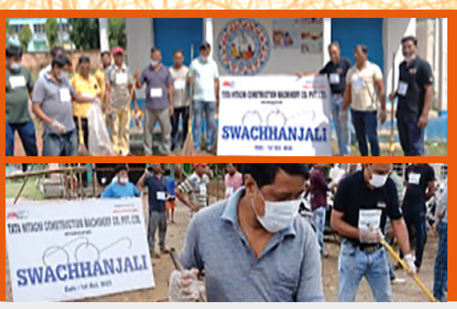
Employees volunteered and joined hands for the Swachhanjali Initiative, undertaking a Village Clean-up Drive in Rupnaryanpur and Baradiha villages, contributing to a cleaner and healthier environment.