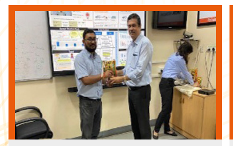
First : (BRAIN STORMERS) PPC - Reduction in Non-moving FG parts.

Felicitation of SGA team winners of FY 22-23 Plant level (In-Direct Category)