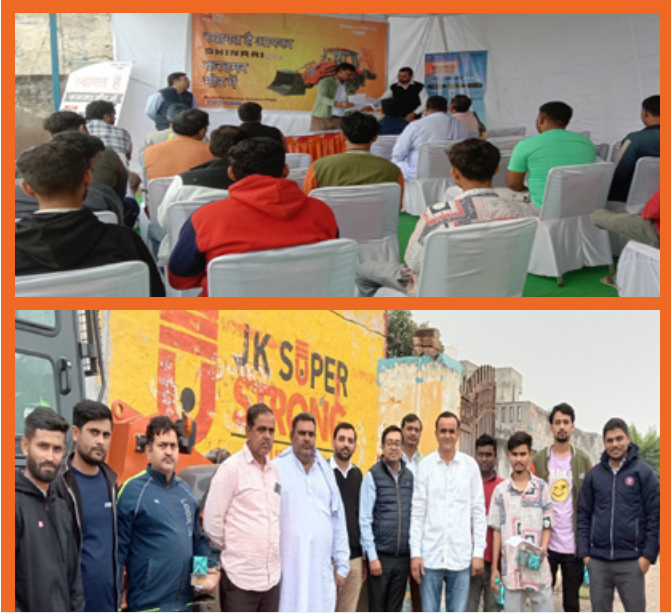
Customer meet conducted at Charkhi, Dadri