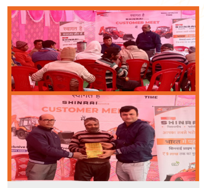
Customer meet conducted at at Baraut