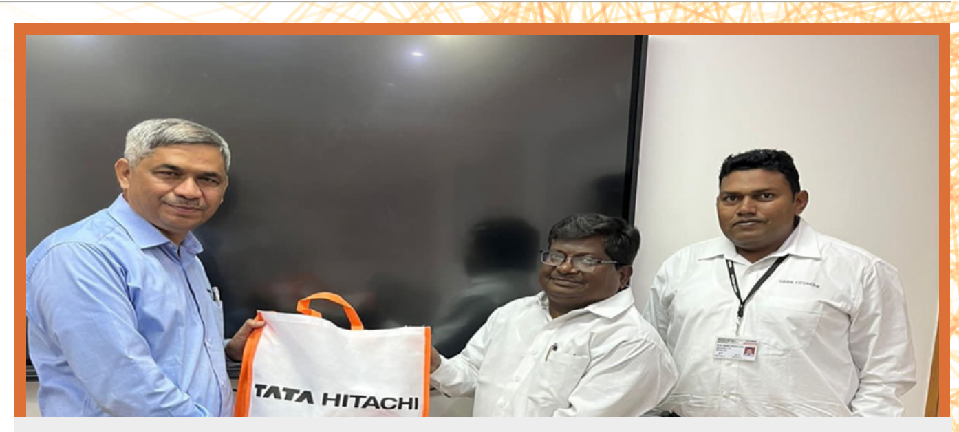
Plant Visit Arranged for Valued Key Account Customer - M/s. Musale Construction, Nagpur.