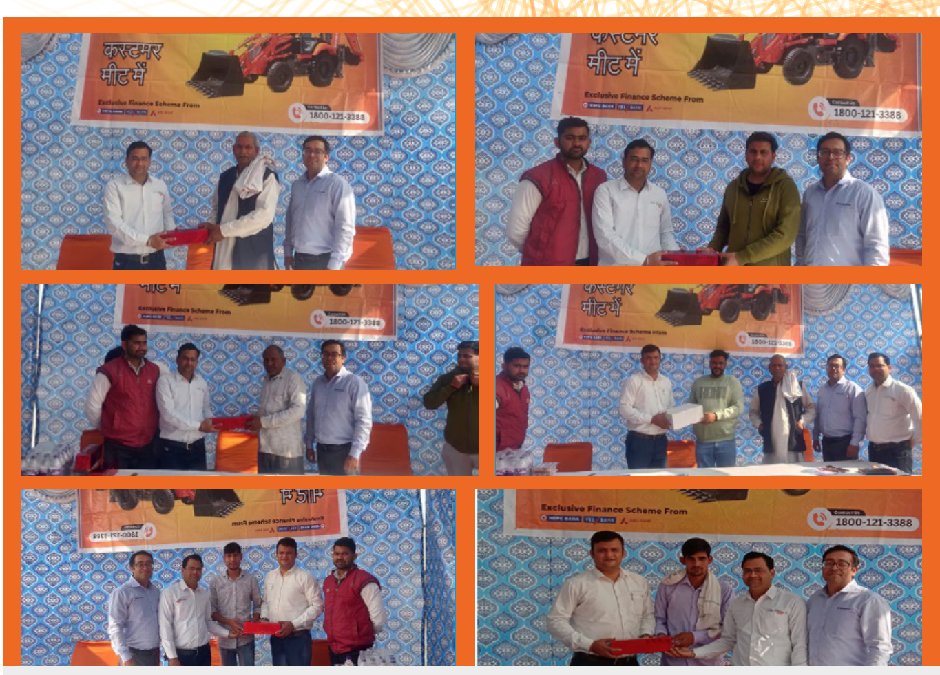
SHINRAI Prime customer meet and felicitation conducted by Time Equipment and Delhi Branch at Palwal.