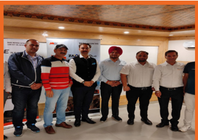
Financer Meet with Mahindra Finance was conducted by Dada Motors in Shimla