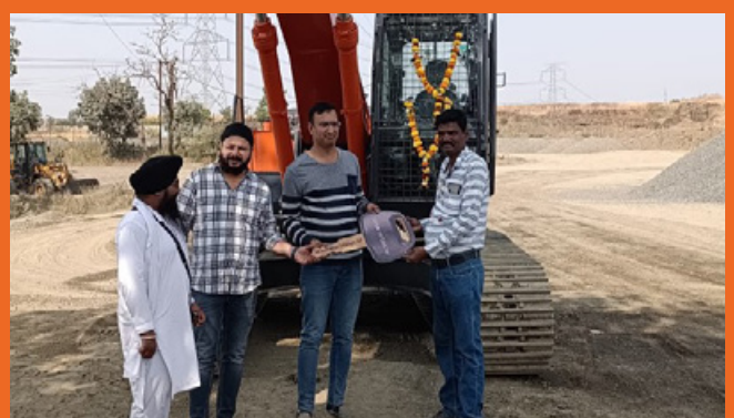
Key handover of 1 unit EX 215LC SLR to M/S. Amar Traders, Chhindwara