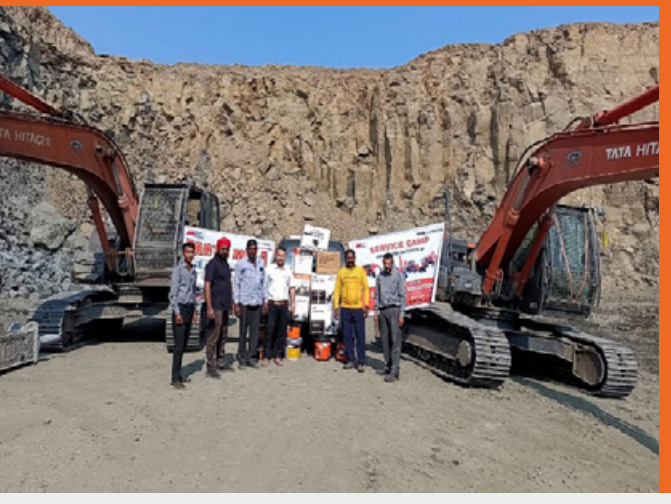
Service Campaign was conducted by SS Excavation, Nagpur