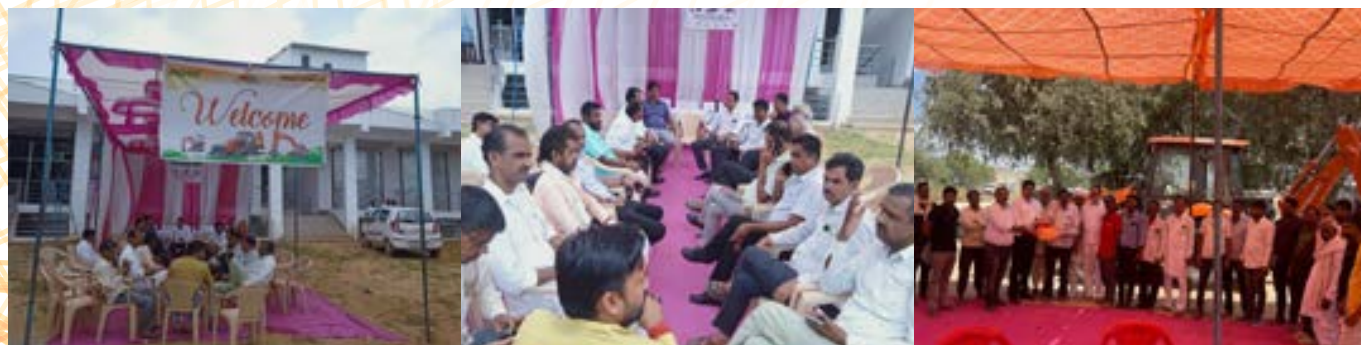
Customer Meet conducted by Ensol Infratech and Jaipur Branch at Srimadhopur, Sikar and Jaipur