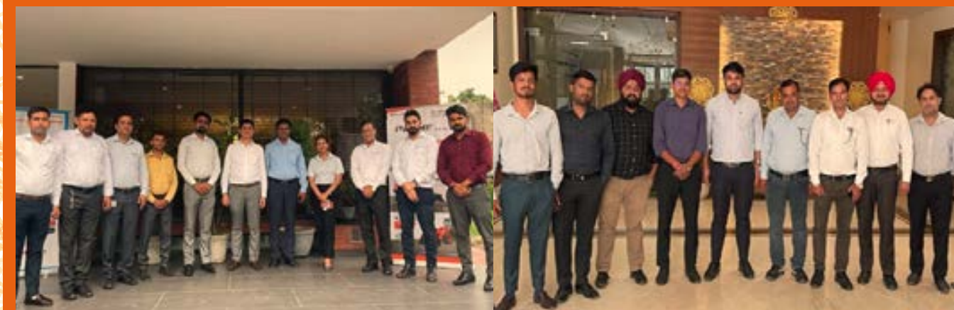
Financier Meet conducted by Dada Motors in Chardigarh and Karnal