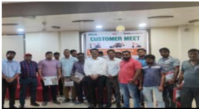
SHINRAI Adda Meet conducted by Ensol Infratech and Jaipur Branch at Beawar, Rajasthan