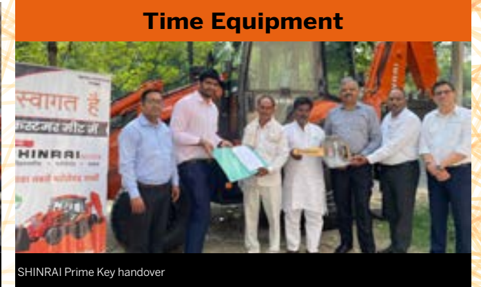
SHINRAI Prime Key handover