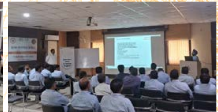
Operator training conducted by Jaipur Branch at Shree Cement, Rajasthan