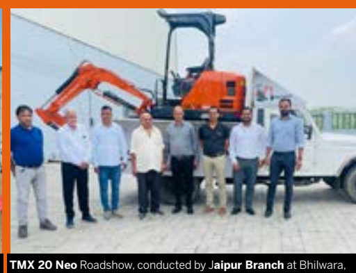
TMX 20 Neo Roadshow, conducted by Jaipur Branch at Bhilwara, Rajasthan