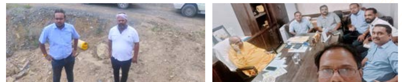
Service campaign conducted by Kailash Infratech