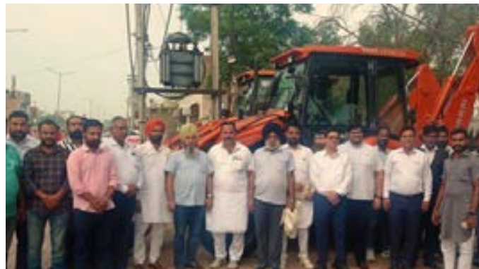
Customer Meet in Bhatinda, conducted by Dada Motors