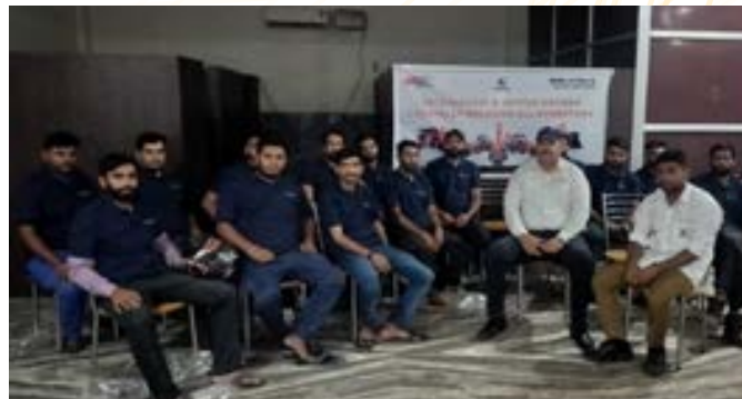
First Operator Training programme conducted by United Motors in Ramban