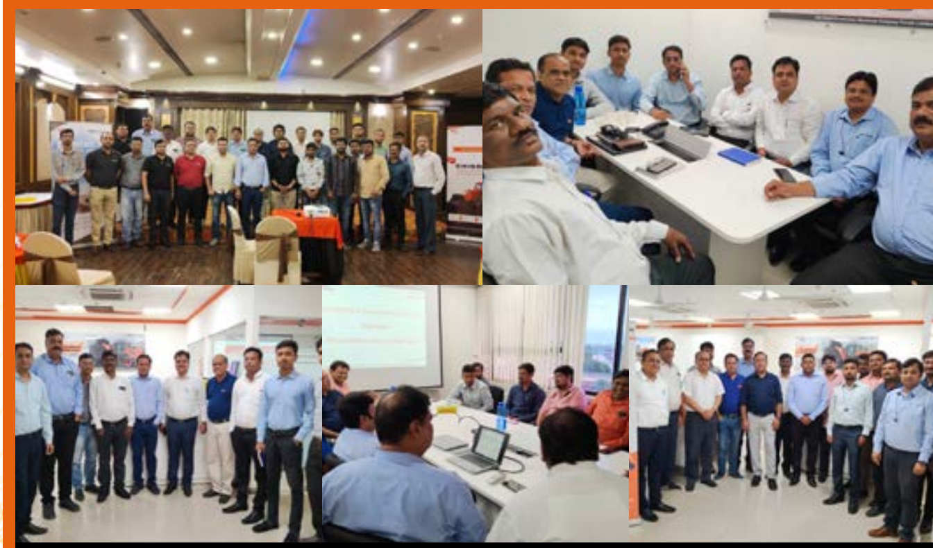
Financier Meet with HDFC Bank, Kotak Mahindra Bank and YES Bank was conducted at Nagpur Regional office .