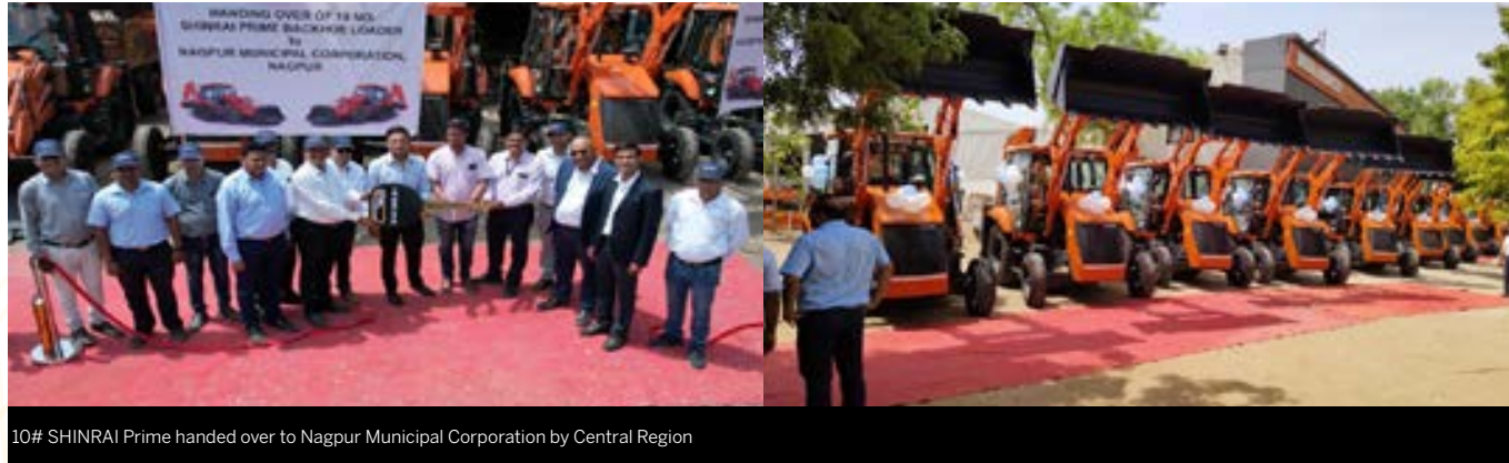
10# SHINRAI Prime handed over to Nagpur Municipal Corporation by Central Region

It gives us immense joy every time, when we delight our customers with the on time delivery of the machine. Here are glimpses of a few key handovers and customer felicitations.