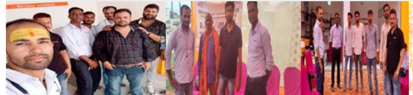
Kailash Infratech Pvt. Ltd. conducted Parts Mela in central region (Nagpur & Jabalpur) on 22 nd August 2023

Parts Melas are an effective way to impress upon the customers the advantage of using genuine Tata Hitachi Spare Parts.