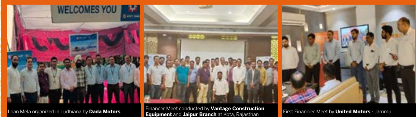
Loan Mela organized in Ludhiana by Dada Motors