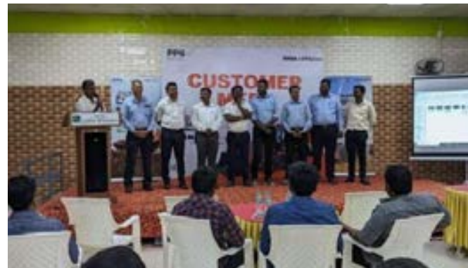
Key Account Meet at Salem and SHINRAI customer meet at Namakkal, organized by PPS Motors