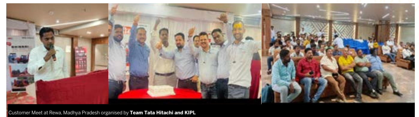
Customer Meet at Rewa, Madhya Pradesh organised by Team Tata Hitachi and KIPL