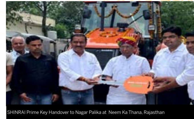
SHINRAI Prime Key Handover to Nagar Palika at Neem Ka Thana, Rajasthan