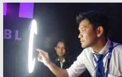
The Photo boxi was a huge hit