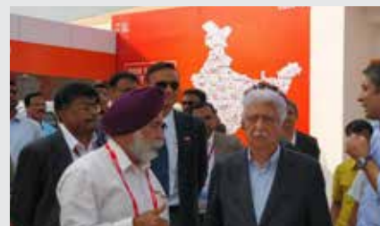
Mr. Azim Premji visits the Tata Hitachi booth