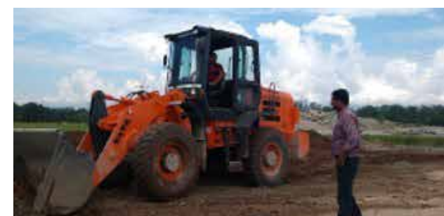
Hot mix plant land developing work