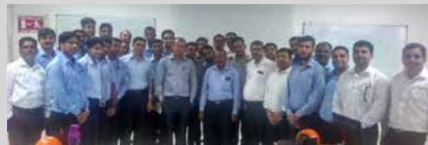
The Swagat team at the Dharwad plant