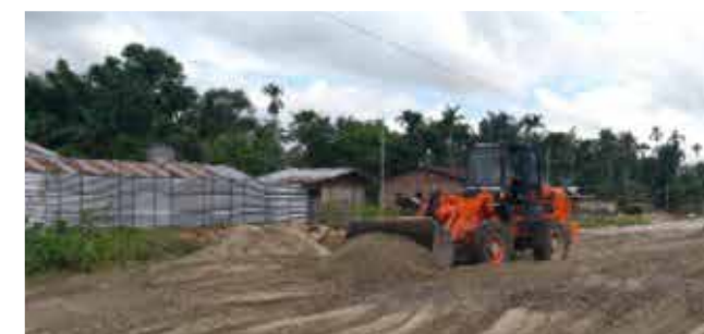
Sand Dozing and leveling for New NH roadways