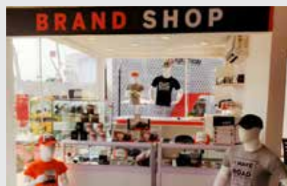
The launch of the Tata Hitachi brand shop