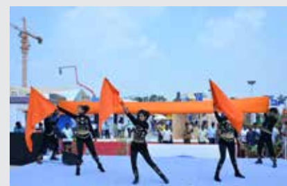
The dancers put on a scintillating performance