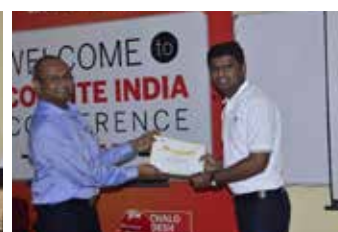
Distribution of participation certificates at CIC