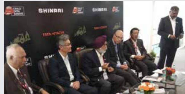
Press Conference at the Tata Hitachi booth

This year, our stall at EXCON 2017 showcased the company's commitment to our brand theme of ' Chalo Desh Banaye '. The star attraction was the unveiling of our all new backhoe loader, TATA HITACHI SHINRAI . The other launches included the launch of ZAXIS140H : the latest addition to the GI series, promising unbeatable performance; the quarry variant of EX210 Super with a heavy duty track chain, rollers, idler and reinforced bucket and front