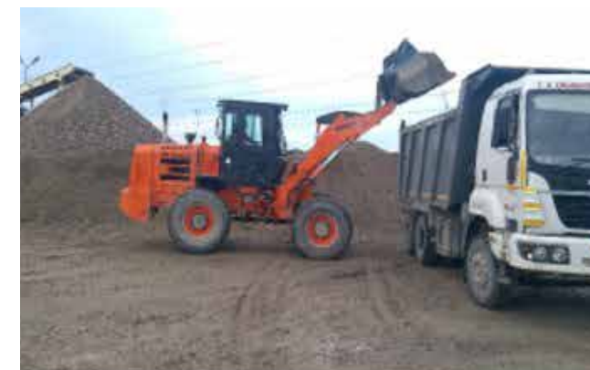
GSB material loading on Dumper at NASBOR Crusher Plant

There was a demo of the game changing TL340H wheel loader at Gohpur, Assam. The jobs handled by the demo machine were loading of GSB material on dumper at the Nasbor and Boorgang crusher plant, loading on dumper & shifting of waste material, sand, aggregates, dozing and leveling of sand & mix aggregates, feeding of sand & aggregates on WMM Plant & Batching Plant, lifting and carrying of diesel drum, tyre, DG set, excavator bucket etc.