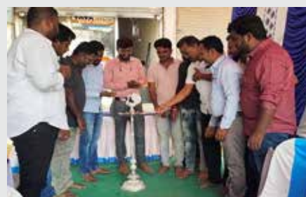
PSN Bangalore Parts Mela at Tumkur