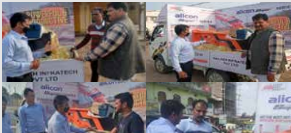
B 215 Rock breaker roadshow

and Tangrakhali (for EX70 Super+), at Jabalpur (for the B 215 Rock breaker), at Bangalore (for EX215 LC Quarry)