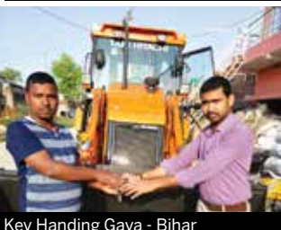
Key Handing Gaya - Bihar