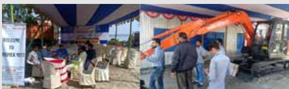
EX70 Super+ roadshow at Canning