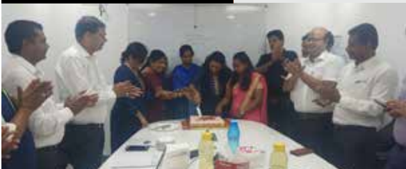
Celebrations at the Bangalore Regional office