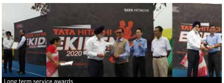
Long term service awards