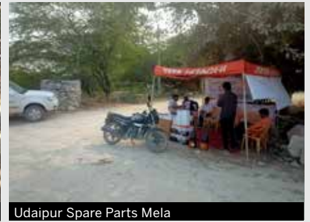
Udaipur Spare Parts Mela