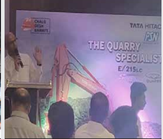
EX215LC Quarry variant launch at Hubli