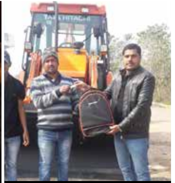
Shinrai Key Handing Sheikhpura - Bihar