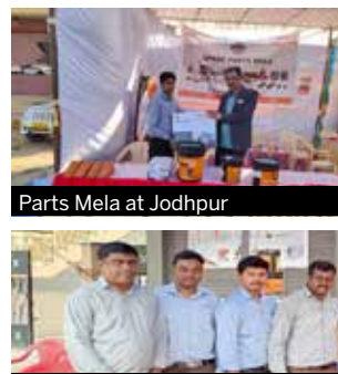
Parts Mela at Jodhpur