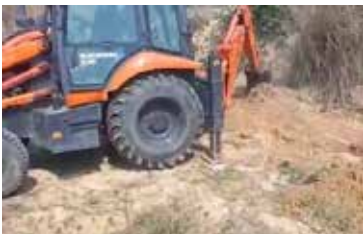
Shinrai demo at Dalmau