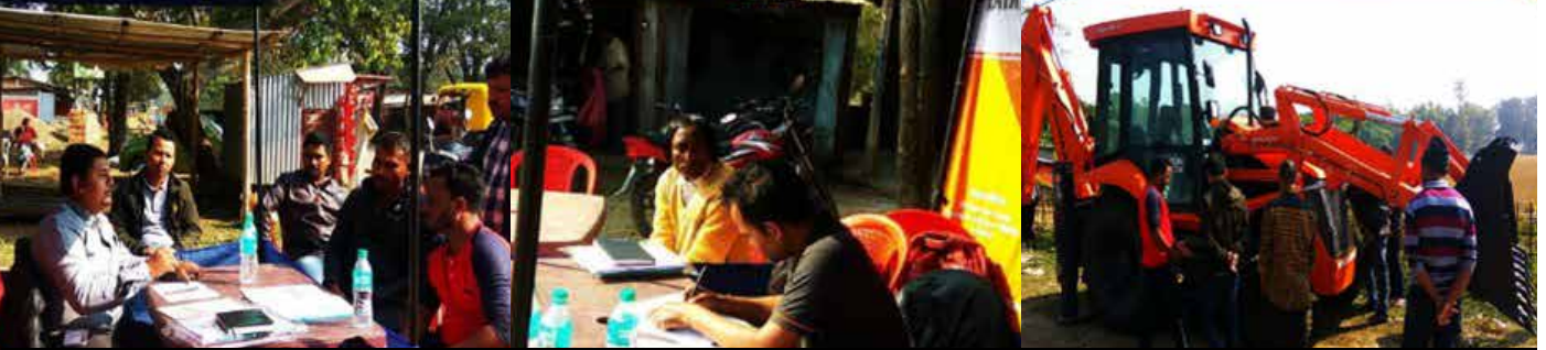
Shinrai roadshow at Silchar