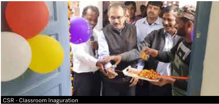
CSR - Classroom Inaguration

Three health camps were organized as a part of our CSR activities. These camps were held at Jambandi, Baradiha and Disinda Primary Schools. 350+ villagers got the benefit which included free check-up and free medicine for 15 days.