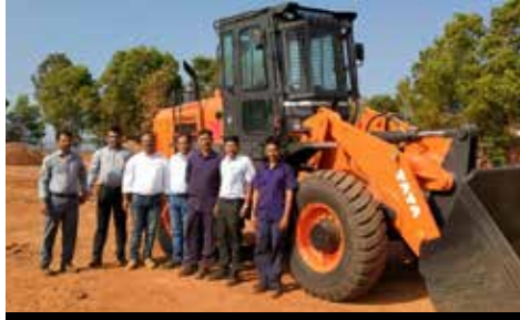
TL340H handover by PSN Hubli