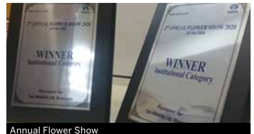
Annual Flower Show

We bagged the 1st prize in 2nd Annual Flower show held at Tata Metaliks in the Institutional Category. The admin team played an instrumental role in improving the landscape in the plant premises.