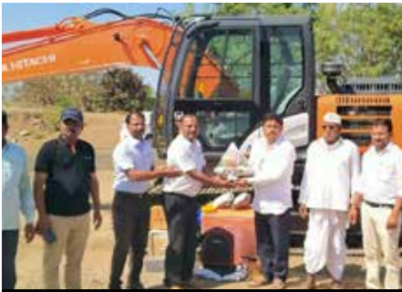
ZAXIS140 delivered by PSN Hubli