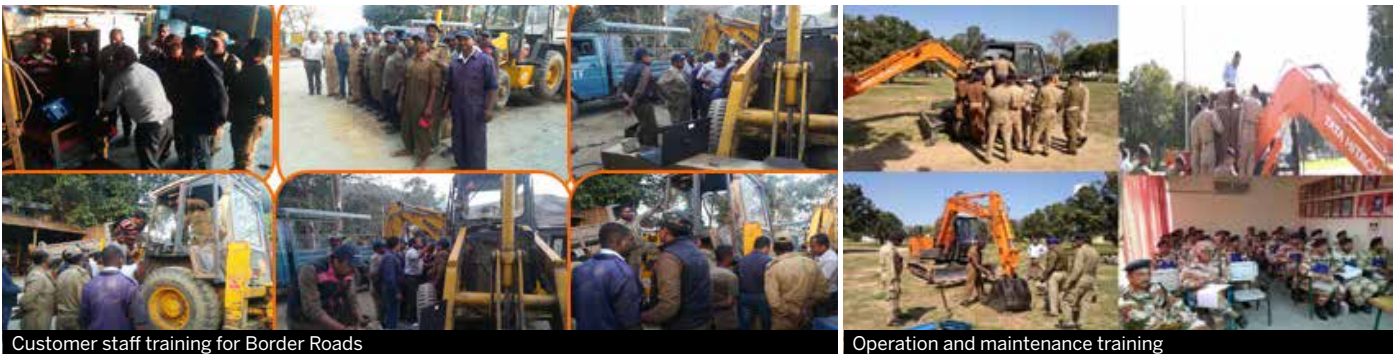
Customer staff training for Border Roads