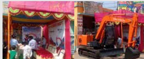
EX70 Super+ roadshow at Tangrakhali