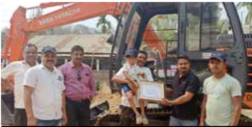
EX70 machine demo and handover at Agartala

Bangalore. EX70 demo and machine handover happened at Agartala. Demos for TL340H took place at RSMML - Jhamarkotra, Bangalore, Shahibganj and Pindwara. A demo cum application study was also done for ZAXIS33U.