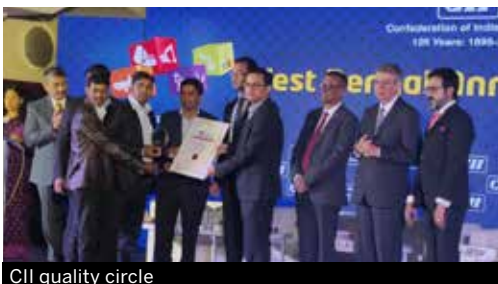
CII quality circle

A team from the fabrication department participated in the State level CII 32nd Convention on Quality Circle Competition held in Kolkata and qualified for Regional and National level.