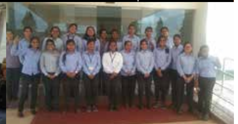
Celebrations at the Dharwad plant