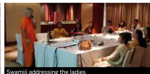
Swamiji addressing the ladies