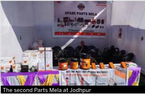
The second Parts Mela at Jodhpur