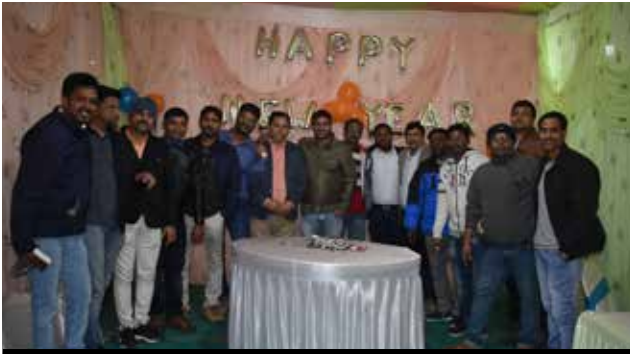
New Year celebrations by the FMC West Bokaro team