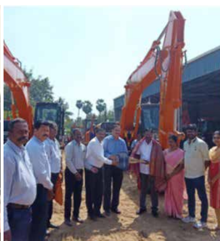
ZAXIS220GI handover by CAG Salem