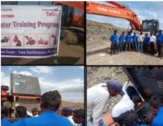
Operator training at Latur

benefits of genuine lubricants and parts and how to reduce breakdown time of machine. The Nellore branch held an RPL4 operators & mechanics training program. PSN Kochi held a training program for operators too.