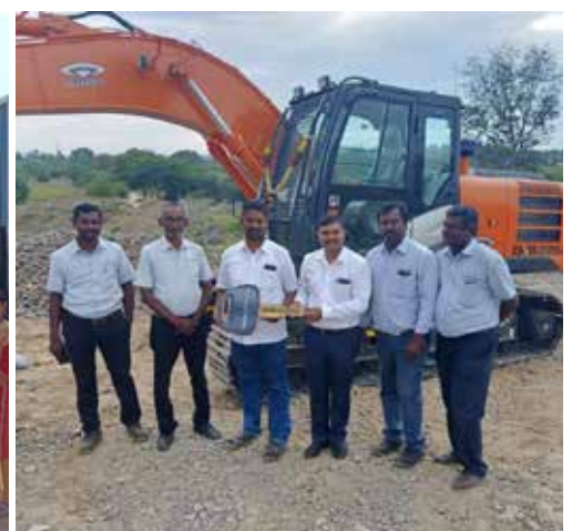
ZAXIS220GI handover by CAG Salem