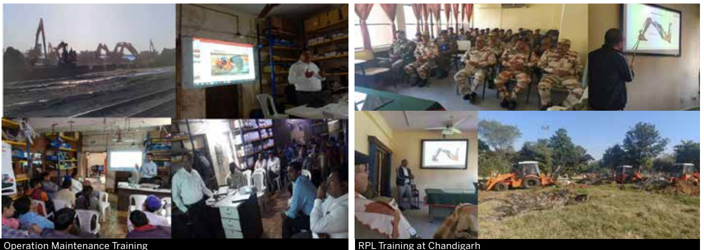
Operation Maintenance Training

The Rajkot team conducted an Operation and Maintenance Training at Navlakhi for operators, mechanics and helpers. A four day RPL training was held at the TPT Battalion-Chandigarh.