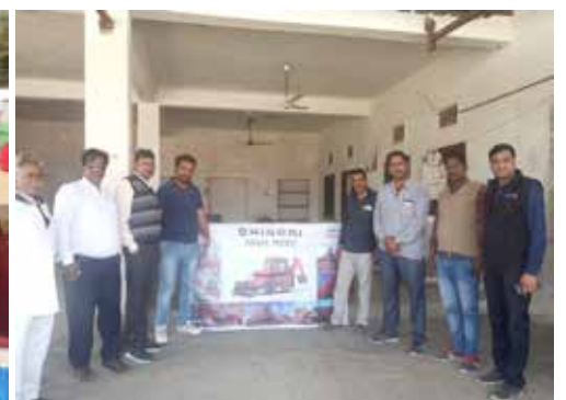
Adda meet at Menar