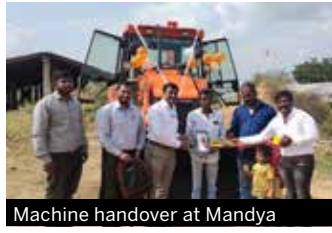
Machine handover at Mandya