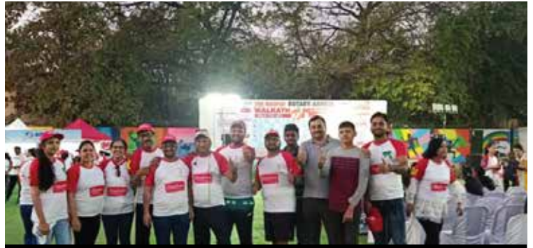
The Nagpur team participating in the walkathon