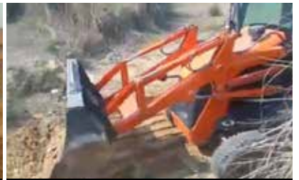
Shinrai demo at Amreshpuri Colony