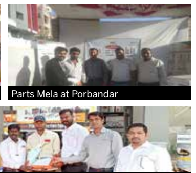
Parts Mela at Porbandar