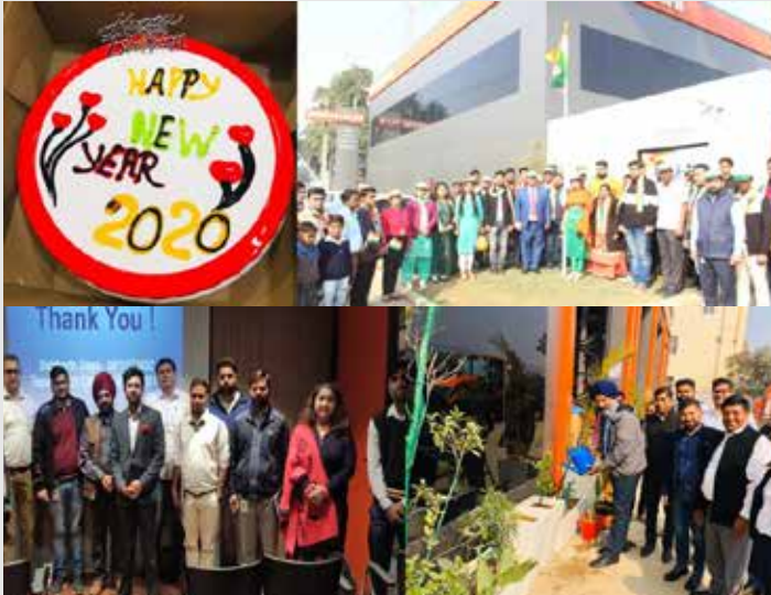
Activities from TIME Equipment

was held at OTC Dharwad. TIME Equipment had a host of celebrations and activities last quarter beginning with celebrating the New Year!