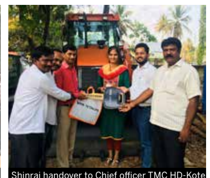
Shinrai handover to Chief officer TMC HD-Kote