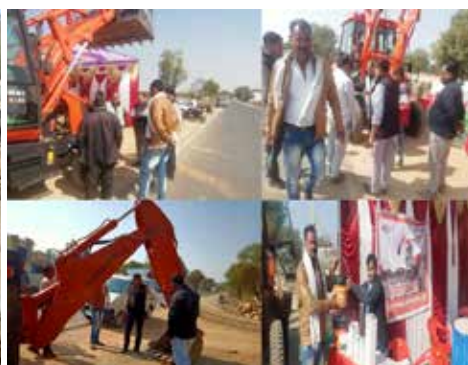
Adda meet at Kurabad