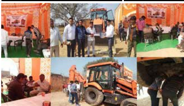
Adda meet at Sikandrabad