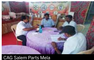
CAG Salem Parts Mela