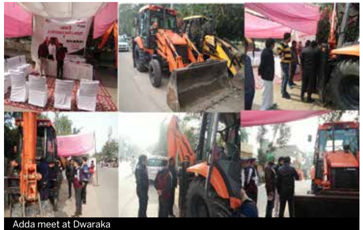
Adda meet at Dwarka

Adda meets were held at Dwarka (in partnership with TIME Equipment), Jaisalmer (in partnership with Ramdev Earthmovers), Sikandrabad, Menar and Udaipur (in partnership with TASS Technical Services) to strengthen connect with the community. TIME Equipment held a Chai-Mela at Faridabad with customers and in partnership with Tata Capital Financial Services Private Limited.