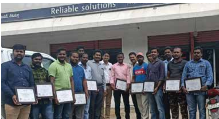
RPL 4 Certificate Handover