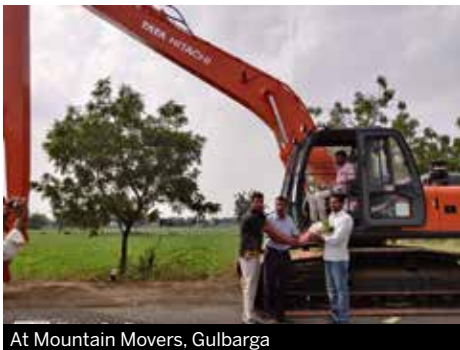
At Mountain Movers, Gulbarga

handed over TMX 20 at Sagar and Shinrai at Betul. Vedant Earthmovers had a Shinrai key handover ceremony at Jamshedpur. In partnership with Rambaag Equipments, felicitation and key handovers were done for customers who had purchased machines in EXCON 2019 at Trichy. Two ZAXIS 870 's were handed over at Dhanbad. ZAXIS 650 key handovers took place at Porbandar. CAG Salem handed over EX 200 Super+ and ZAXIS 220 GI excavators at Salem.