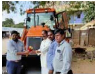
Machine handover at HB Hali