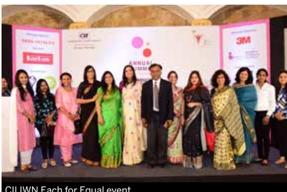
CII IWN Each for Equal event

• IWN, Karnataka organized the Annual 2020 Summit, with the theme of 'Each for Equal' at Bangalore. It featured memorable Keynotes, thought-provoking Fire-side Chats and an useful panel. The summit convened a diverse range of luminaries from Industry, Academia, Sports & Professions. Tata Hitachi was a key sponsor at this event and was well represented with our women participants.