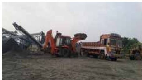
Shinrai demo in dirt CAG Salem