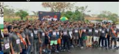
The excited participants

EKIDEN Kharagpur: A total of 550+ employees, including 318 runners and 50 volunteers gathered for the event. There was spontaneous participation from all sections of employees including Operators, supervisors, mangers and departmental heads. Japanese advisors also participated in the event and ran the race.