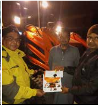
Shinrai handover at North Bihar