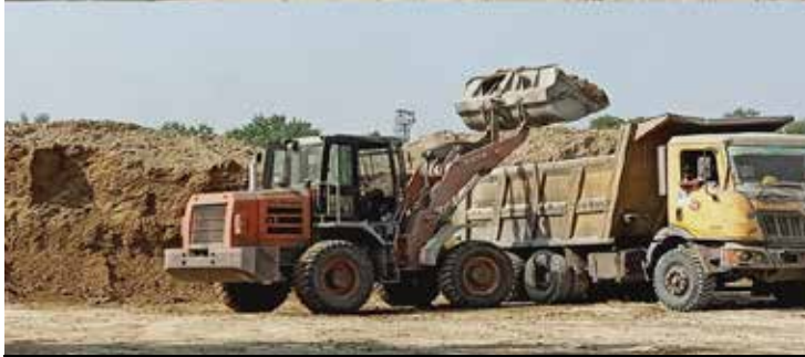
TL340H demo at Pindwara