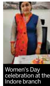
Women's Day celebration at the Indore branch