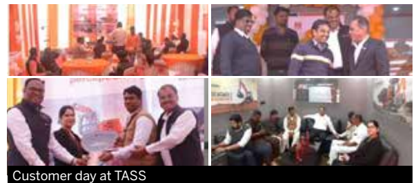
Customer day at TASS

Customer day celebrations were held at TASS Technical Services, Udaipur . Along with customers, representatives from financiers also attended this meet. There was a demo of our telematics suites - ConSite and InSite - and the online parts ordering in the experience zone.