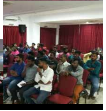
Trivandrum Operator Meet