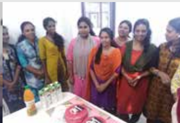
Celebrations at the Cochin office