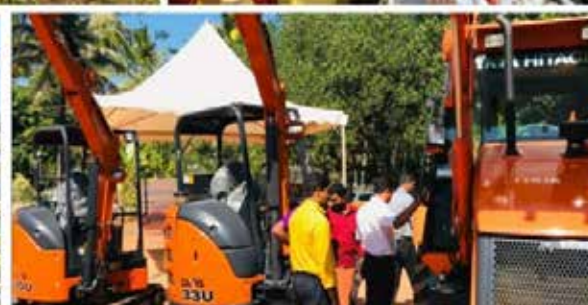
PSN Kochi mini expo and loan mela