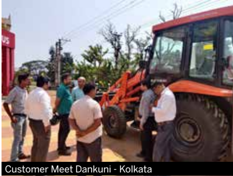
Customer Meet Dankuni - Kolkata