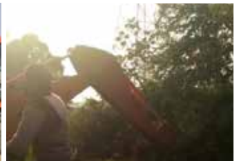
Shinrai demo at Palwal City