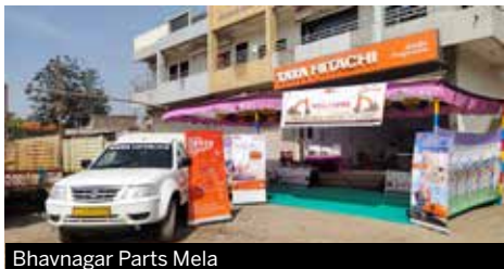
Bhavnagar Parts Mela

and at Yadgir. Ramdev Earthmovers held two Parts Melas at Jodhpur. TIME Equipment held Parts Melas at Haldwani, Dehradun and Rishikesh Agarkhal Chamba Route, Uttarakhand. Tass Technical Services Pvt. Ltd. organized three Spare Parts Melas at Udaipur.