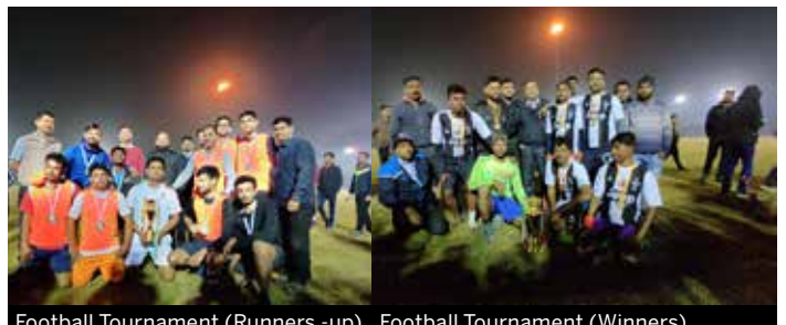
Football Tournament (Runners -up) Football Tournament (Winners)

The Tata Hitachi Football Tournament concluded with the final match played between Fabrication Super Kings and Daredevils. Fabrication Super Kings clinched the 1st Championship of the Football Tournament in the final match.