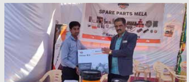
Ramdev Earthmovers Parts Mela