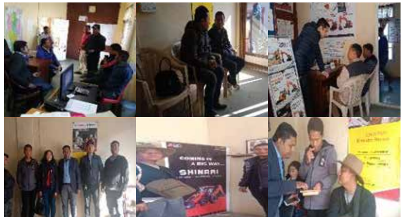
Loan fest at Aizwal

In partnership with SS Excavation Solutions loan melas were held at Buttibori and Nagpur. E S Infraserve organized a loan mela at Dhamnod. Kailash Infratech held a loan mela at Gwalior. A loan mela was held at Hospet. Harsheel Infraequip organized a loan mela at Bhopal. N E Equipment Solutions organized a loan fest at Aizwal.