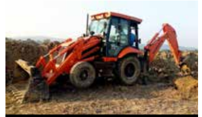
Demo in dirt at Ghatsila