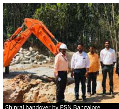
Shinrai handover by PSN Bangalore