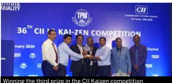
Winning the third prize in the CII Kaizen competition

A team from the plant participated in the 36th National Kaizen Competition organized by the Confederation of Indian Industries, Institute of Quality at Chennai. The Robot section of the fabrication team won the 3rd prize in Innovative Kaizen category.