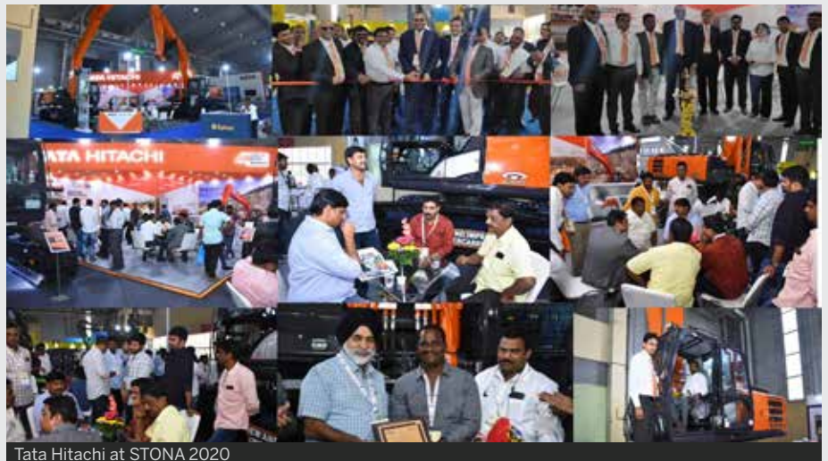
Tata Hitachi at STONA 2020