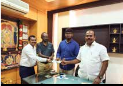
TL340H handover by CAG Salem