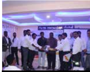
Customer meet at Tumkur

Shinrai handovers took place at Bangalore, Bellary, Dharwad, H B Hali, Mandya, Peenya, Kote and Tumkur. Customer meets were held at Tumkur and Betul. NE Equipment Solutions held a roadshow at Silchar. PS Earthmovers held roadshows at Egra and Ghatal. Vedant Earthmovers organized demo in dirt at Ghatsila. In partnership with Trishul Tread, an operator's meet was organized at Baripada.