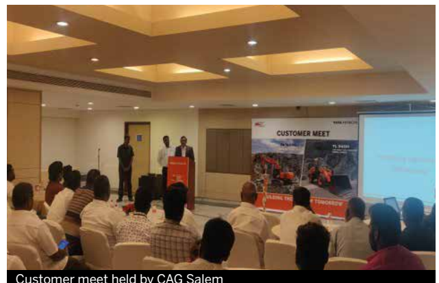
Customer meet held by CAG Salem

A small customer meet was held at Satna-Madhya Pradesh . CAG Salem held a customer meet too. In partnership with TIME Equipment , a customer meet for EX130Super+ was held at Sehri, Kharkhonda, Sonipat and at Madurai in partnership with Vetri . A launch and customer meet for EX215LC Quarry was held at Koderma. In partnership with PS Earthmovers , a customer meet was held at Kharagpur. A customer meet was held in Bangalore by PSN Bangalore too.