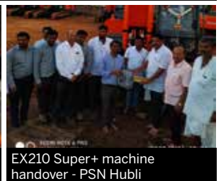
EX210 Super+ machine handover - PSN Hubli