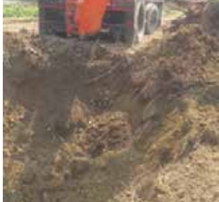
Shinrai demo at Rae Bareili