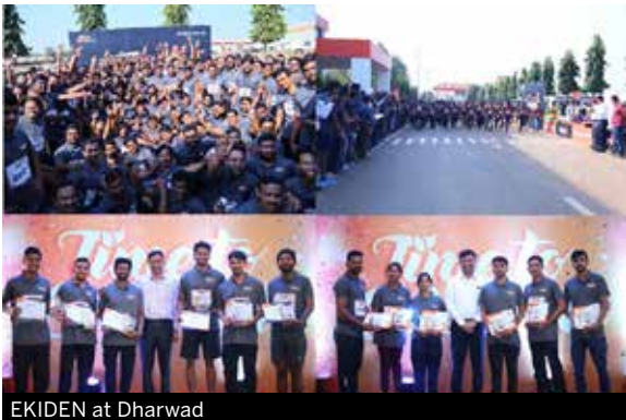
EKIDEN at Dharwad