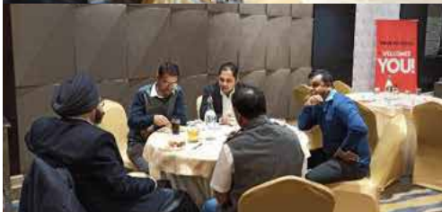
Guwahati financier meet