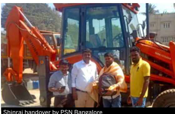
Shinrai handover by PSN Bangalore