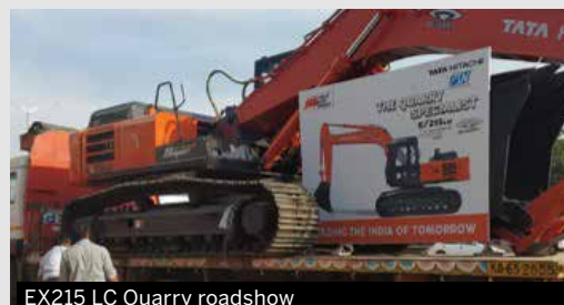
EX215 LC Quarry roadshow