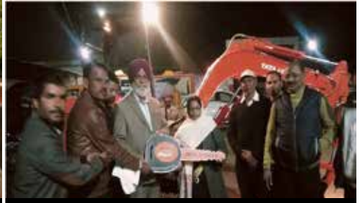
TMX20 handover at Sagar