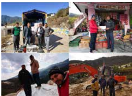
Parts Mela at Haldwani