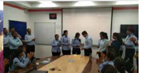
Celebrations at the Dharwad plant