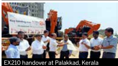
EX210 handover at Palakkad, Kerala