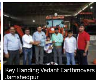
Key Handing Vedant Earthmovers Jamshedpur