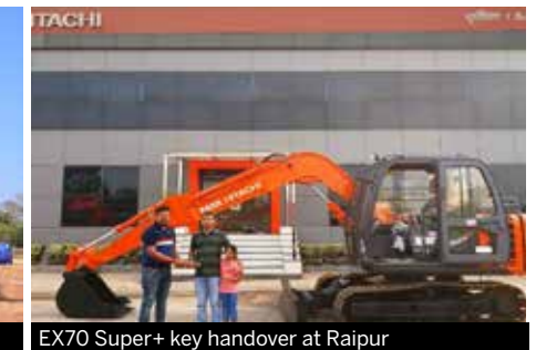
EX70 Super+ key handover at Raipur