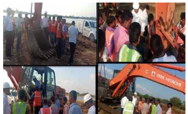
The second Operator Training meet at Latur