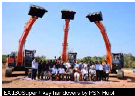
EX 130Super+ key handovers by PSN Hubli