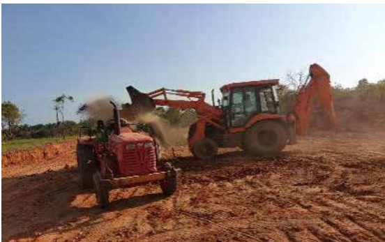
TL340H demo at Bangalore