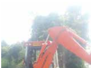
Shinrai demo at Mall Road, Lucknow