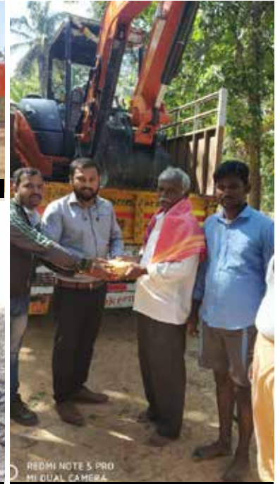
ZAXIS33U handover by PSN Tumkur