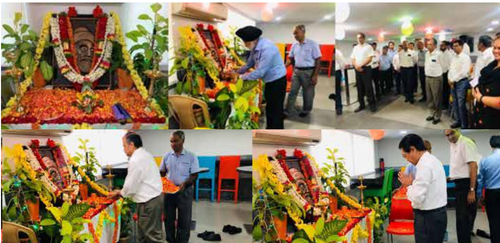
Founder's Day Celebrations at the Corporate Office