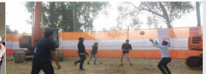
Employee engagement initiatives at NE Equipment Solutions