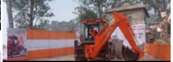
Operator skill test at Aizwal