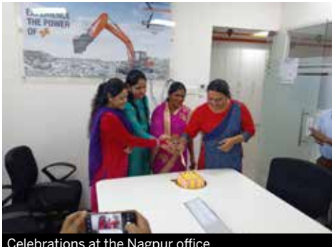
Celebrations at the Nagpur office