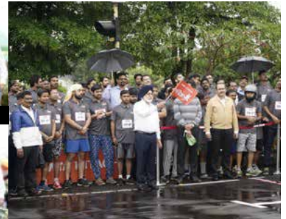
Race flag off