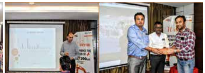
Financier meet in partnership with Suryakiran Earthmovers