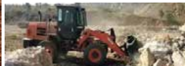
TL340H demo at Jhamarkotra