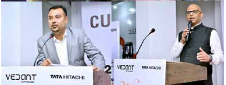
EX215LC Quarry launch and customer meet at Koderma