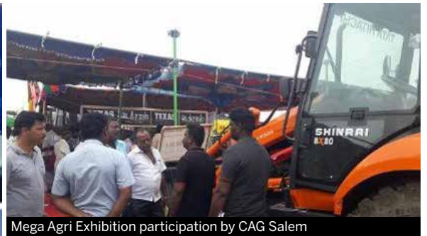
Mega Agri Exhibition participation by CAG Salem