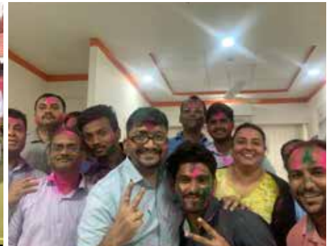
Nagpur branch celebrating Holi