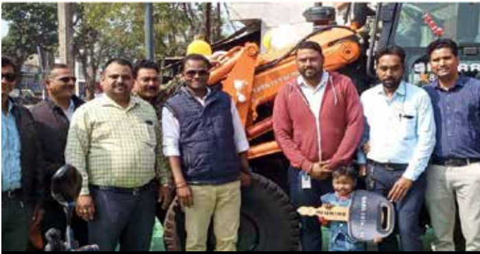
Shinrai handover at Betul