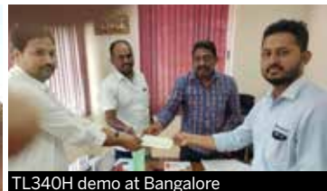
TL340H demo at Jhamarkotra