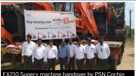
EX210 Super+ machine handover by PSN Cochin