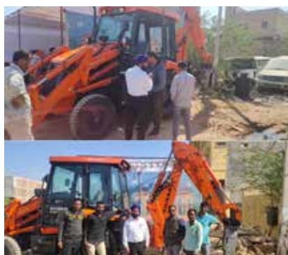
Adda meet at Jaisalmer