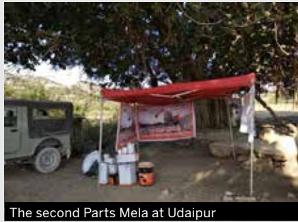
The second Parts Mela at Udaipur