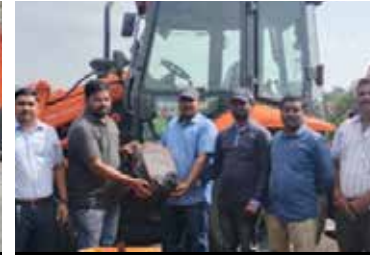
Machine handover at Bellary