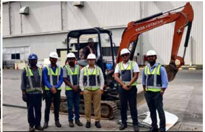
ZAXIS33U application study