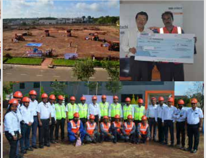
Dealer service competition at OTC Dharwad