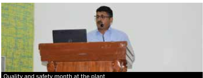
Quality and safety month at the plant

Quality and safety month celebrations were held at the plant.