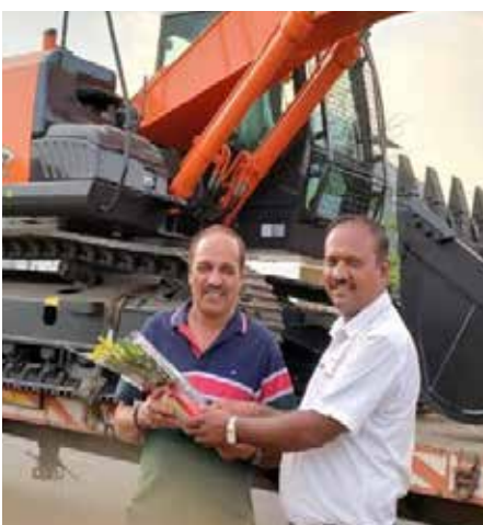
ZAXIS220 Quarry handover at Belgaum