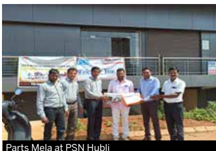
Parts Mela at PSN Hubli