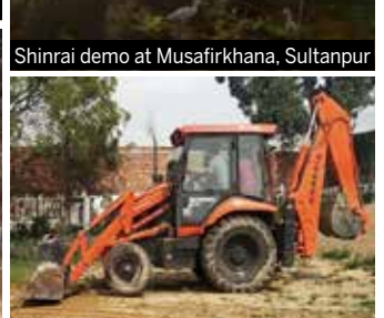
Shinrai demo at Sultanpur