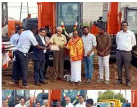
Customer felicitations and key handovers at Trichy