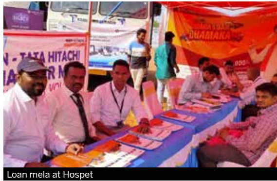
Loan mela at Hospet