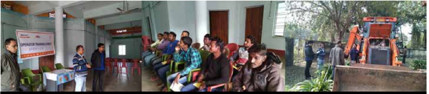
Shinrai Operators Meet