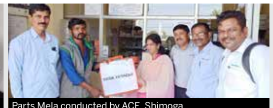
Parts Mela conducted by ACE, Shimoga