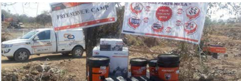
Service Camp at Pagda

A service camp along with a Spare Parts promotion camp was held at Pagdha - in partnership with Total Mumbai.