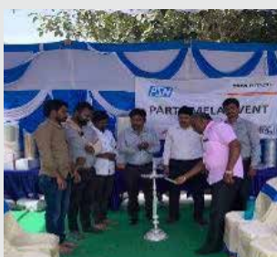
PSN Bangalore Parts Mela at Kolar