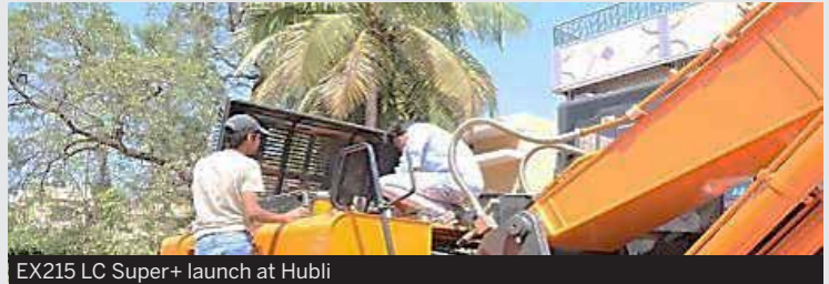
EX215 LC Super+ launch at Hubli

EX 215 LC Super+ and EX 215 LC Super+ Quarry were launched at Hubli amidst great fanfare. In partnership with Vetri, EX 215 LC Super+ Quarry was launched at Madurai.