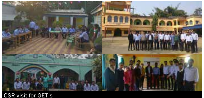
CSR visit for GET's

GETs of the 2019-20 batch visited the major CSR projects as a part of the training program. The projects they visited included Jafala Junior High School, Baradiha Primary School, Gholageria School, Jamboni School, Disinda School and Rupnarayanpur School