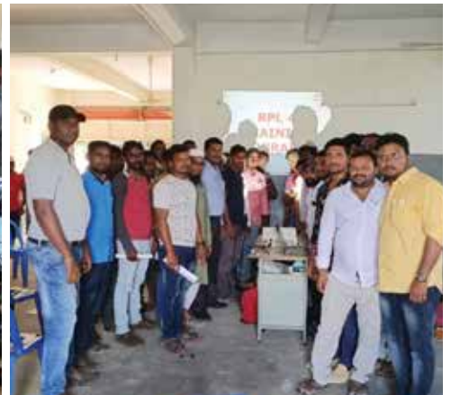
Operator Training by the Nellore branch