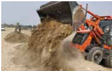
Shinrai demo at Musafirkhana, Sultanpur