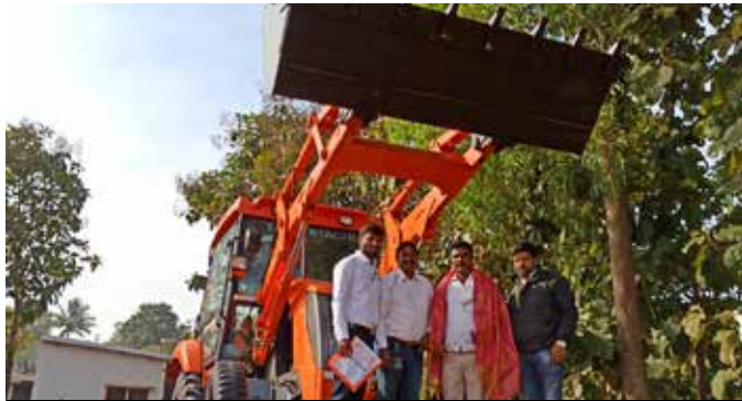
Machine handover at Tumkur