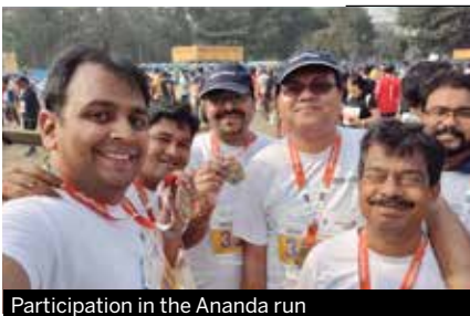
Participation in the Ananda run