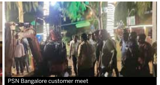
PSN Bangalore customer meet