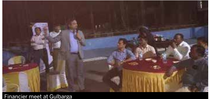
Financier meet at Gulbarga

A financier meet was held at Gulbarga , a second with Sundaram Finance in partnership with CAG Salem . Meets were held at Guwahati , at Prayagraj in partnership with Pawansut Earthmovers , and at Chattisgarh in partnership with Suryakiran Earthmovers .