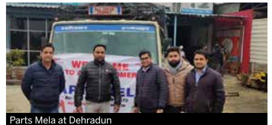
Parts Mela at Dehradun