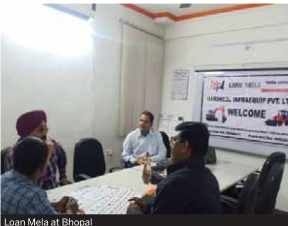
Loan Mela at Bhopal