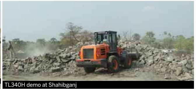
TL340H demo at Shahibganj