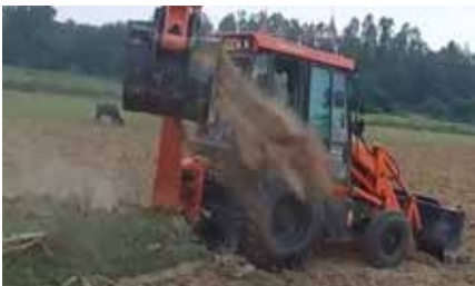
Shinrai Demo in dirt CAG Salem