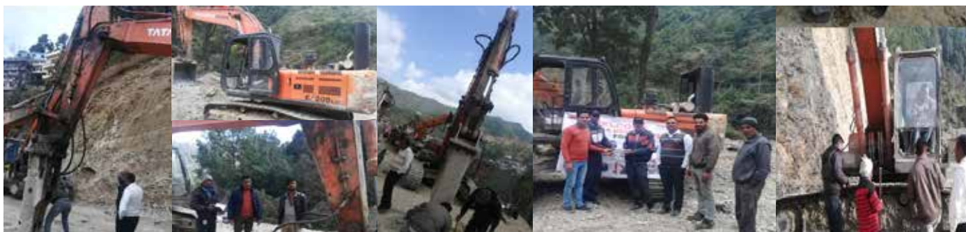
Service campaign at Uttarakhand

A Service Campaign and Parts Mela was held at Chamba, Uttarakhand.