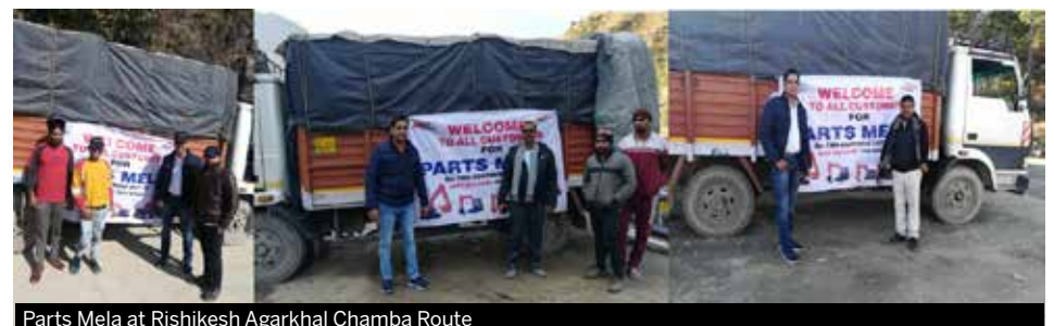
Parts Mela at Rishikesh Agarkhal Chamba Route