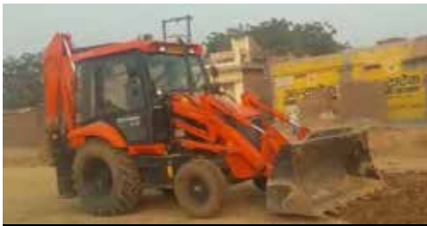
Shinrai demo at Aihar, Dalmau, Raebareli