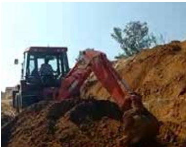
Shinrai demo at Dhammour Amethi