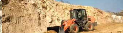
TL340H demo at Jhamarkotra