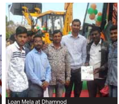
Loan Mela at Dhamnod