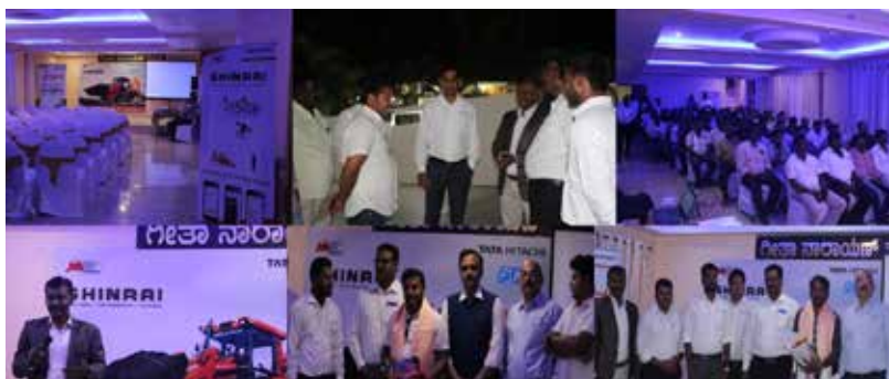
Shinrai customer meet at Tumkur