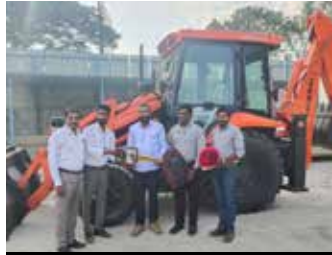
Machine handover at Bangalore