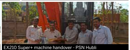
EX210 Super+ machine handover - PSN Hubli