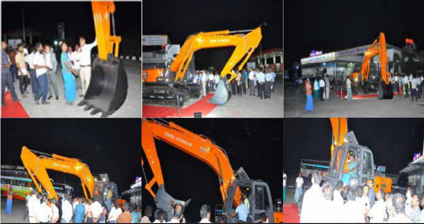
EX215 LC Super+ Quarry launch at Madurai