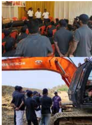
Operator training by PSN Kochi