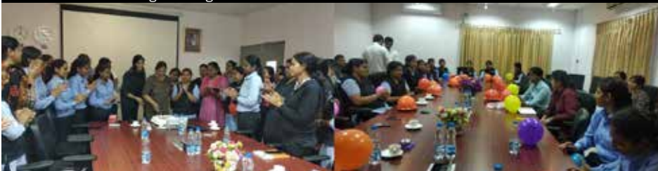
Celebrations at the KGP plant