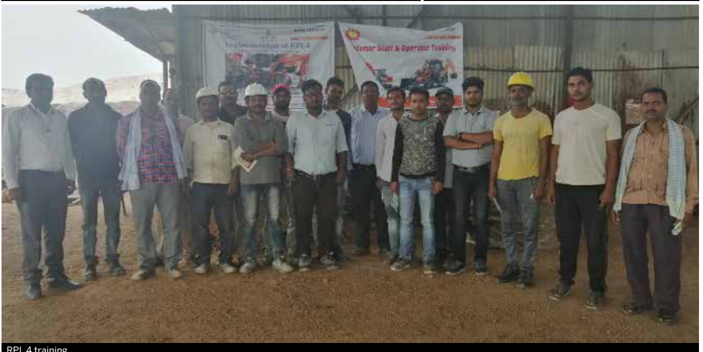
RPL 4 training