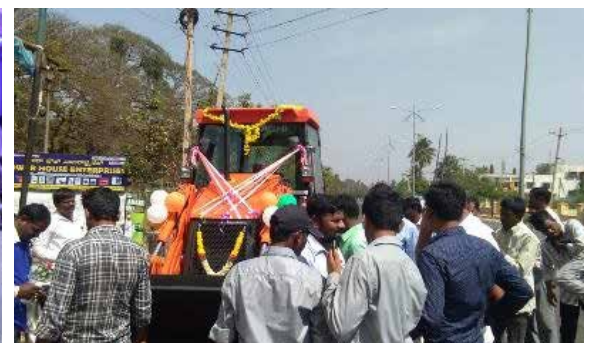
Shinrai customer meet by PSN Hubli