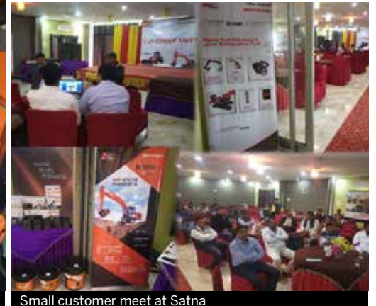
Small customer meet at Satna