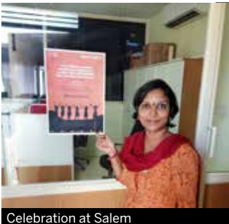
Celebration at Salem