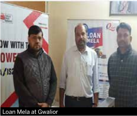
Loan Mela at Gwalior