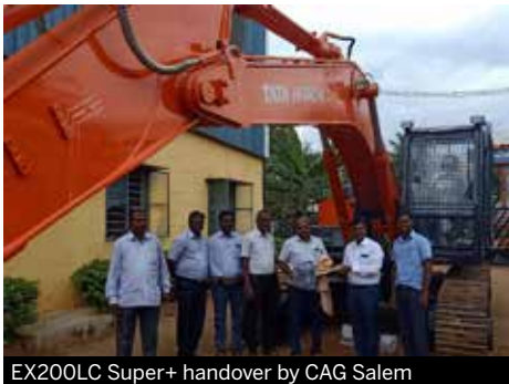
EX200LC Super+ handover by CAG Salem