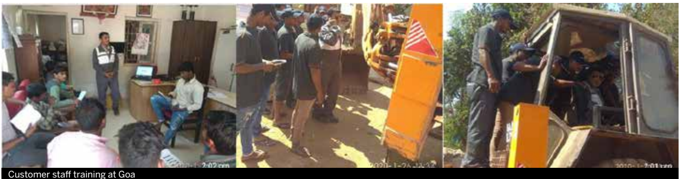
Customer staff training at Goa

Super with Rock Breaker TRB60 was held for ITBP, Transport Battalion Chandigarh. Operators and maintenance staff of Fortune Stone Limited (Katahra Mines)Chhatarpur, Madhya Pradesh underwent a RPL 4 training.