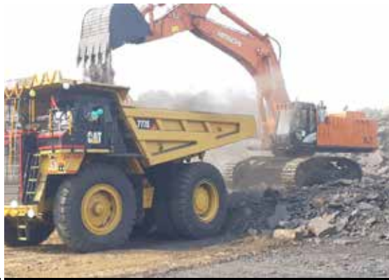
ZAXIS 870 Key handover at Dhanbad