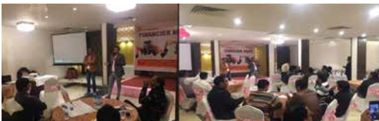
Financier meet in partnership with Pawansut Earthmovers