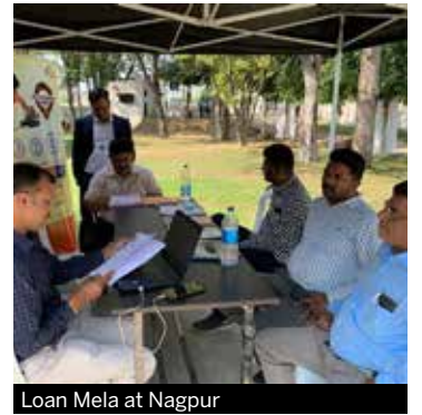
Loan Mela at Nagpur