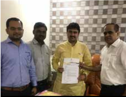
ZAXIS 33U handover