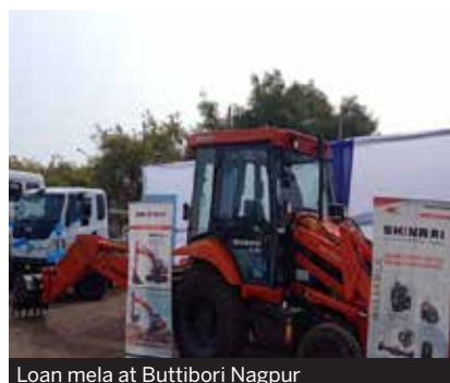
Loan mela at Buttibori Nagpur