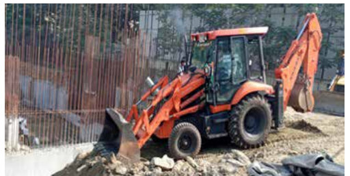
Shinrai demo in dirt PSN Bangalore