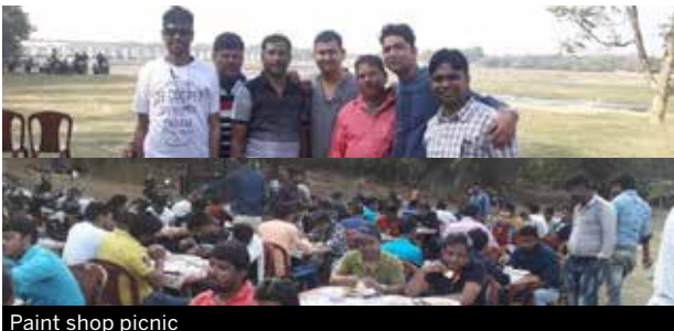
Paint shop picnic

A picnic was arranged by the employees of the Paint Shops. This was indeed a remarkable event in terms of Team Building and Camaraderie. This is also special because it involved employees from different shops (Paint) including contract employees.