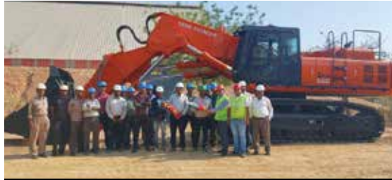
ZAXIS 650 key handover at Porbandar