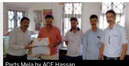
Parts Mela by ACE Hassan