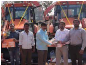
Machine handover at Dharwad