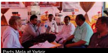
Parts Mela at Yadgir