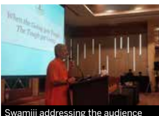
Swamiji addressing the audience