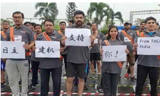
Message to support HCM China