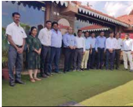
Hubli branch employee connect