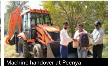
Machine handover at Peenya