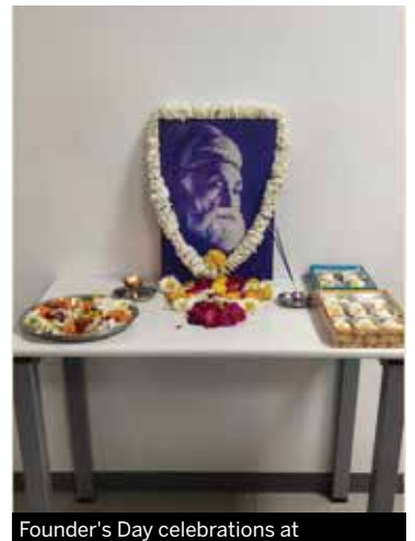
Founder's Day celebrations at the Nagpur branch