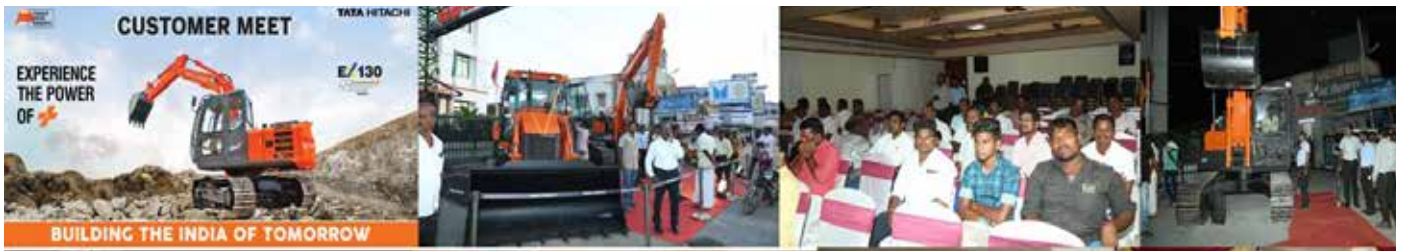
EX130 Super+ customer meet at Madurai