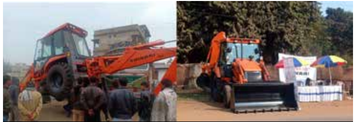
Roadshows at Egra and Ghatal