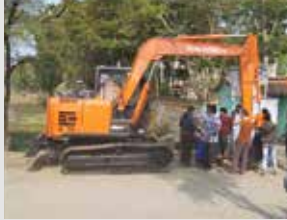
EX70 Super+ roadshow at Jamtala