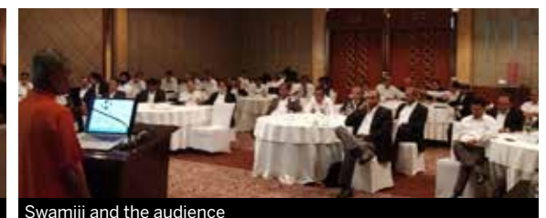
Swamiji and the audience