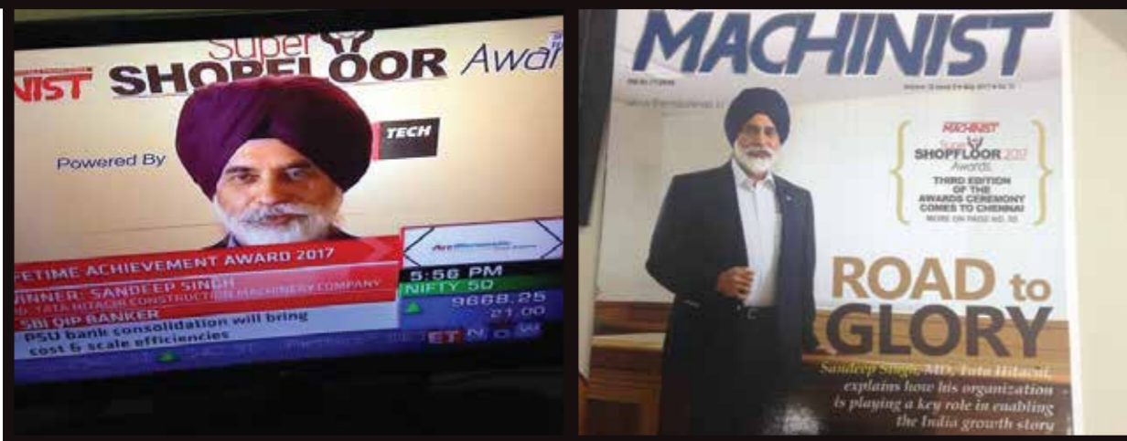
The Lifetime Achievement Award televised event on ET NOW.