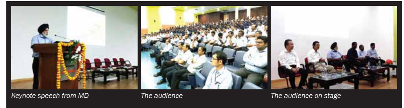
Keynote speech from MD