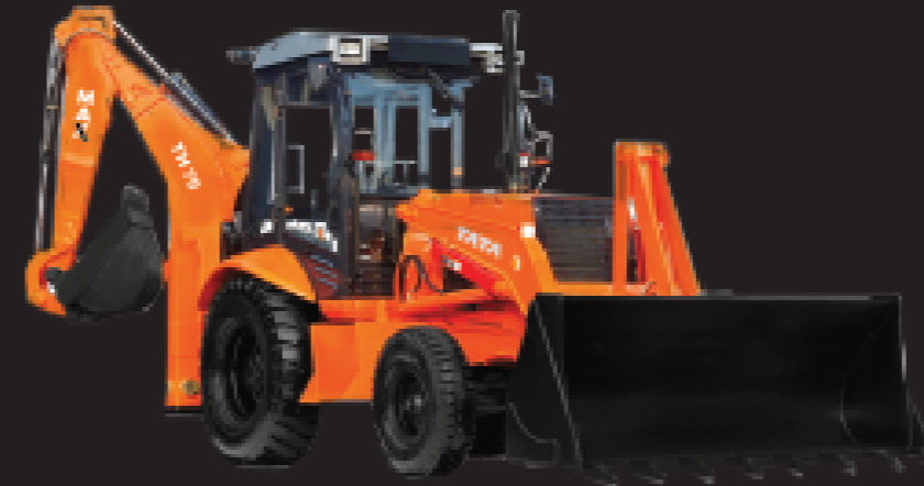
MAX Series TH76