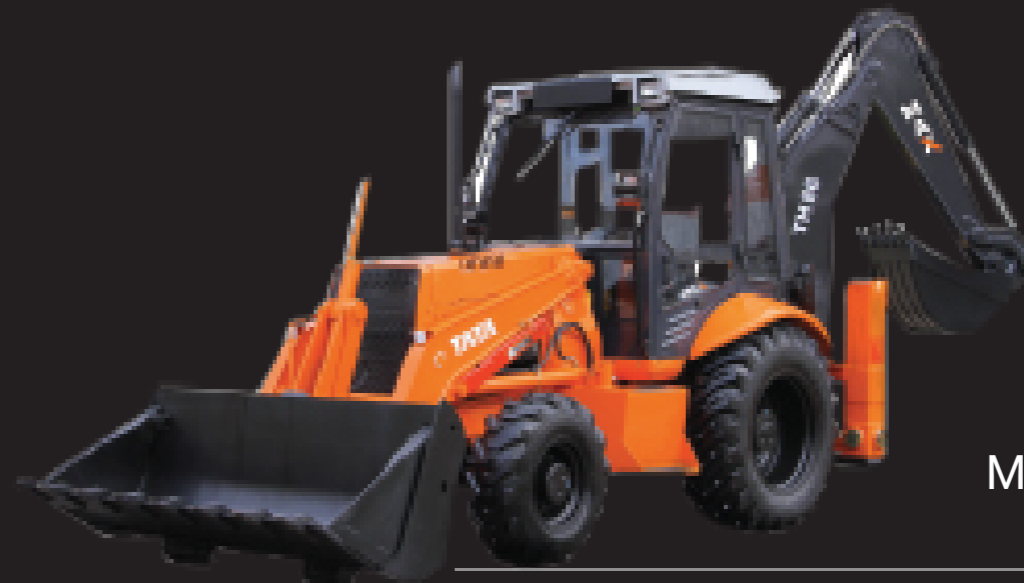
MAX Series TH86