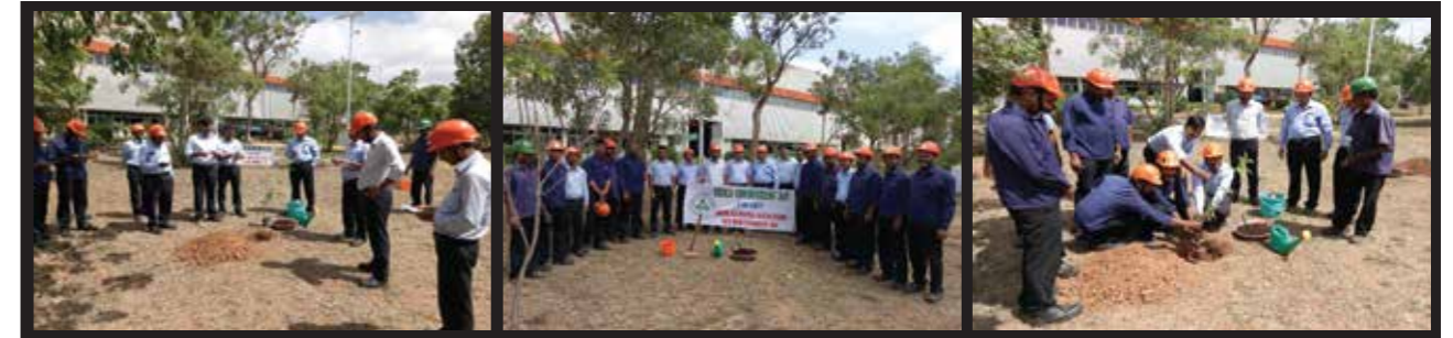
Employees reading the Environment Protection Tips