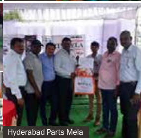
Hyderabad Parts Mela