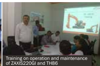
Training on operation and maintenance of ZAXIS220GI and TH86