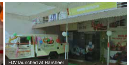
FDV launched at Harsheel