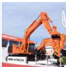
The Tata Hitachi Booth

At IMME, we demonstrated our unmatched strength in Mining by showcasing our Hydraulic excavators: ZX870H, ZX650, ZX470H (Backhoe), & the Wheel Loader TL340H. Along with this, our support pavilion showcased ConSite, the Training Simulator, the FMC Pavilion, attachments (Rock Breaker), spares support counter and the new Hammerless tooth points designed and developed by Hitachi for the Ultra Large Class of excavators.