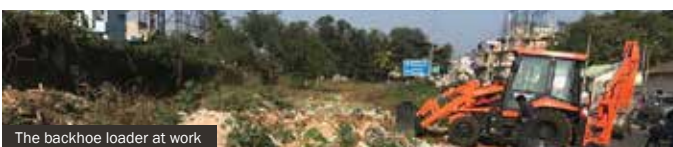
The backhoe loader at work