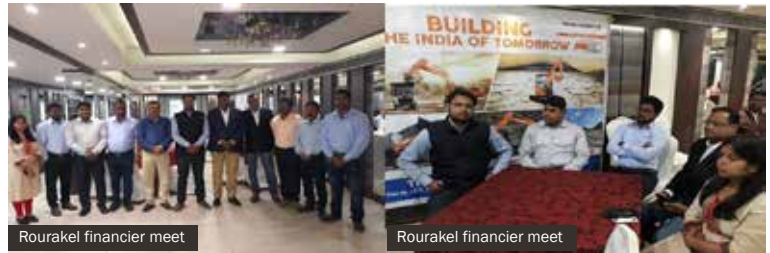
Rourakel financier meet

In partnership with Ramdev Earthmovers, a Financier meet was organized at Jodhpur , to engage with local financiers' fraternity and showcase the New Super plus excavators and create awareness for our range of products Financier meets were also organized at Kochi (PSN Earthmovers) and Rourakel (Trishul Tread)