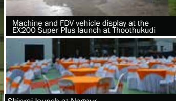
Shinrai launch at Nagpur