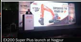
EX200 Super Plus launch at Nagpur