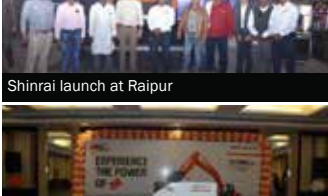
Super Plus Launch at Jaipur