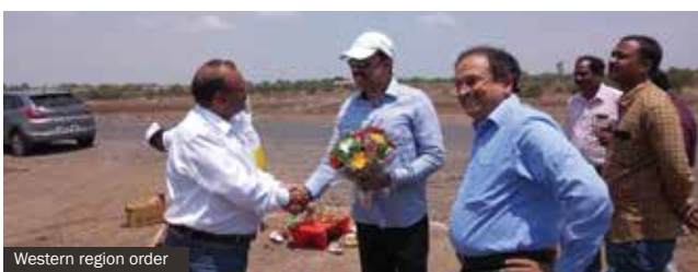
Western region order