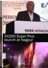
EX200 Super Plus launch at Nagpur