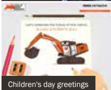
Children's day greetings