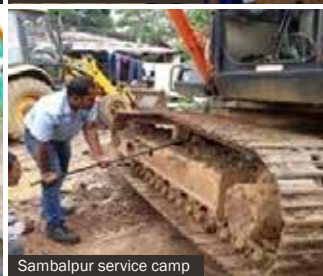
Sambalpur service camp