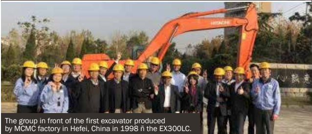
The group in front of the first excavator produced by MCMC factory in Hefei, China in 1998 in the EX300LC.