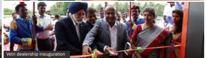
Vetri dealership inauguration