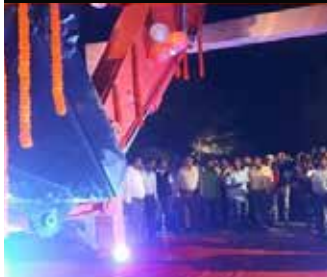
EX210 Super Plus launch at Sambalpur, Orissa