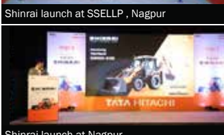
Shinrai launch at Nagpur