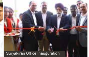
Suryakiran Office Inauguration