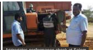
Aggregates performance check at Salem

46 machines were inspected at a free service camp organized in partnership with Trishul Tread at Sambalpur . Camps were organized at customer sites at Krishnagiri and at Karur district, Salem. PSN organized a service campaign at the Chitradurga Branch.