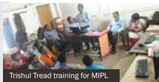
Trishul Tread training for MIPL