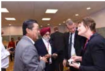
Interaction at the protocol lounge