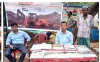
TH86 roadshow at Mohanpur