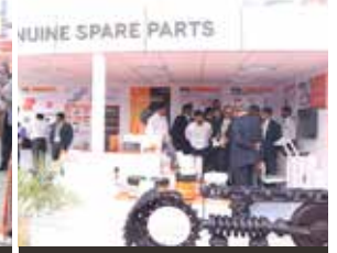
Spare Parts booth