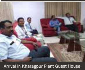
Arrival in Kharagpur Plant Guest House