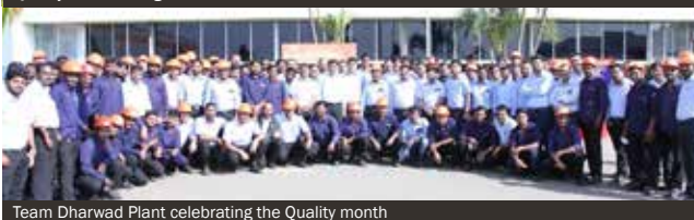
Team Dharwad Plant celebrating the Quality month