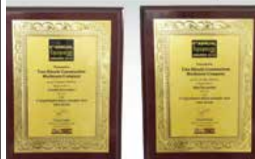
Tata Hitachi wins Awards again !

Believing that excellence is not an act, but a habit, we were delighted to have received recognition from the market and within our group. Congratulations to our team members for keeping the Tata Hitachi flag flying high.