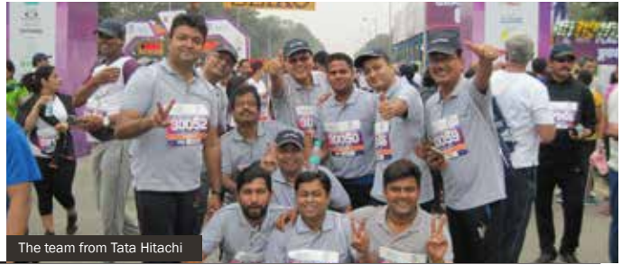
The team from Tata Hitachi

We participated in the Tata Steel Marathon in Kolkata. The 15 member contingent participated in the 5km Ananda Run and completed the stretch well in time. Through this, we supported Tata Medical Centre Kolkata in their fight against cancer.