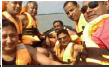
Guest Enjoying Sea Drafting