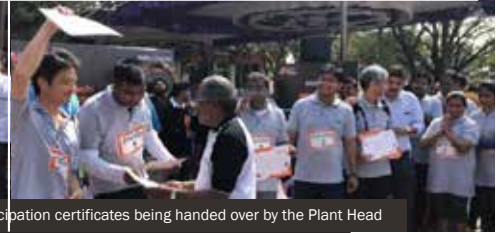
Participation certificates being handed over by the Plant Head