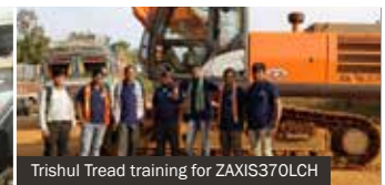
Trishul Tread training for ZAXIS370LCH