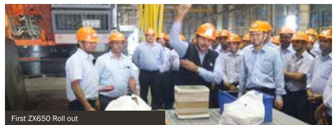
First ZX650 Roll out

• Roll out of first ZX650 excavator from Heavy Excavator Shop: The plant rolled out the first Heavy excavator ZAXIS650 from the new Heavy Excavator shop, KGP