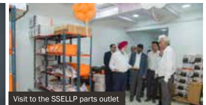
Visit to the SSELLP parts outlet