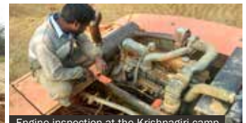
Engine inspection at the Krishnagiri camp