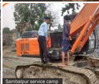
Sambalpur service camp