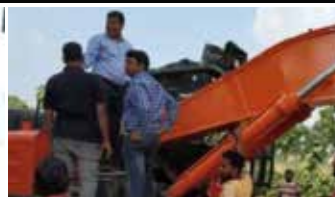
EX210 Super Plus launch at Sahar