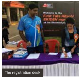
The registration desk