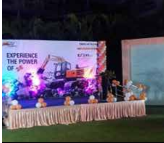
EX210 Super Plus launch at Sambalpur, Orissa