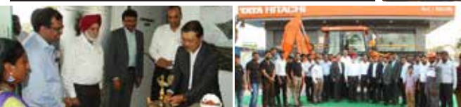
Experience zone and parts outlet opening at Recon Technologies