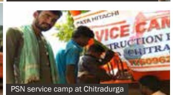
PSN service camp at Chitradurga