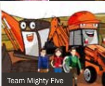
Team Mighty Five