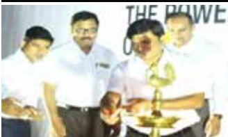
EX210 Super Plus launch at Raipur