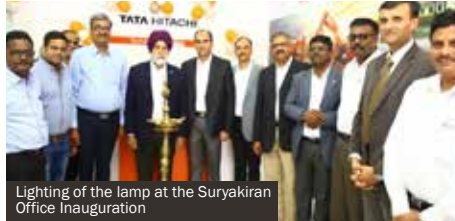
Lighting of the lamp at the Suryakiran Office Inauguration