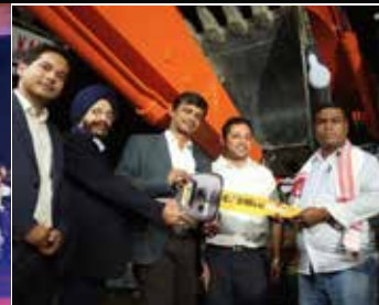
EX210 Super plus launch at Barpeta, Assam