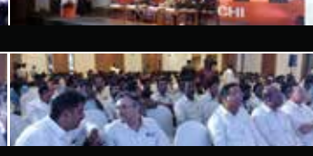
Shinrai launch at Hyderabad