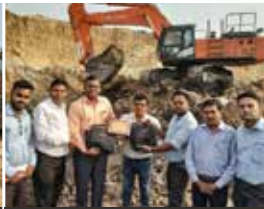
Seven ZAXIS470 machines handed over to Sadbhav Engineering Limited