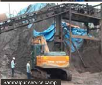
Sambalpur service camp