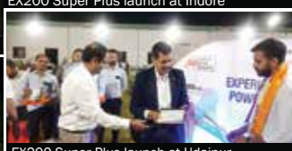
EX200 Super Plus launch at Udaipur