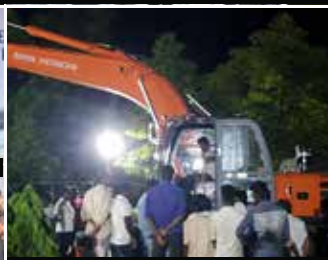
Customers interacting with the machine at the Thoothukudi launch