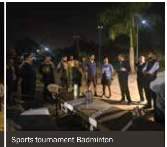
Sports tournament Badminton