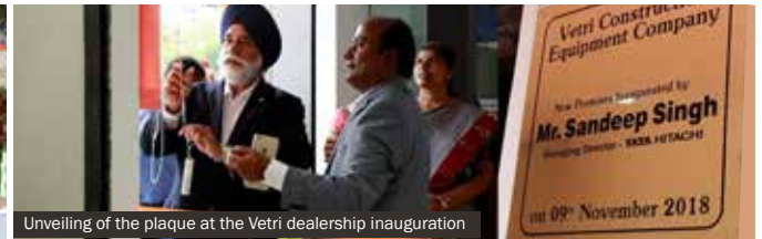
Unveiling of the plaque at the Vetri dealership inauguration