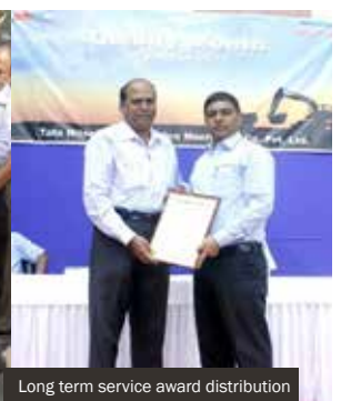
Long term service award distribution