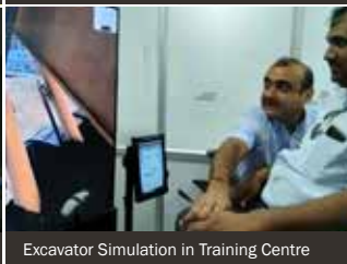
Excavator Simulation in Training Centre