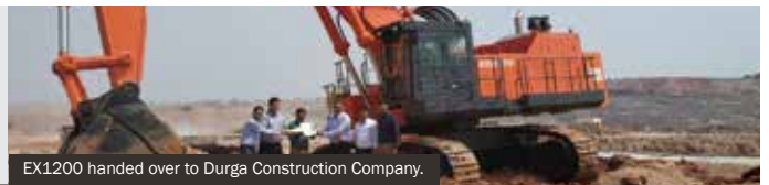
EX1200 handed over to Durga Construction Company.