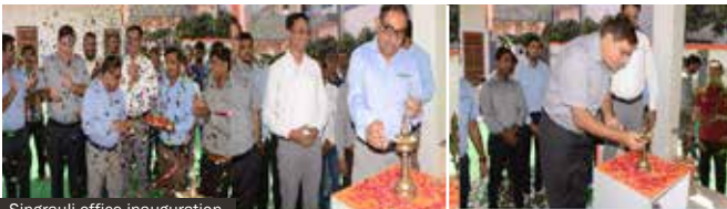
Singrauli office inauguration