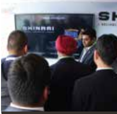
Shinrai App Launch