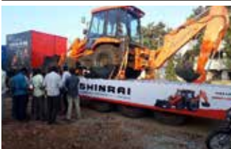
Shinrai road show and demo was held at Hyderabad