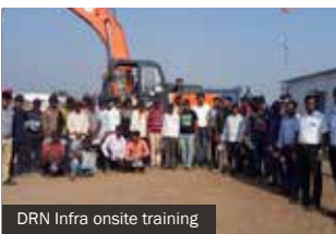
DRN Infra onsite training