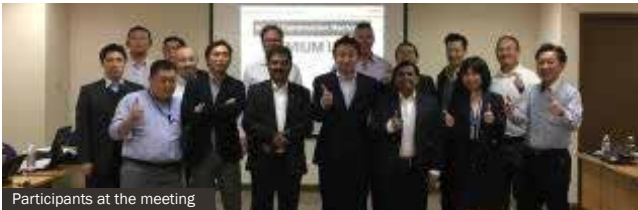
Participants at the meeting