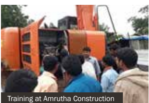
Training at Amrutha Construction