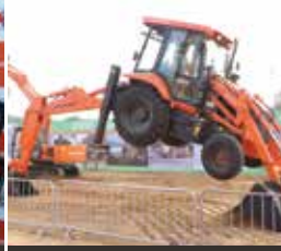
The Shinrai demo