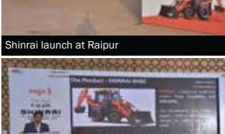
Shinrai launch at Raipur