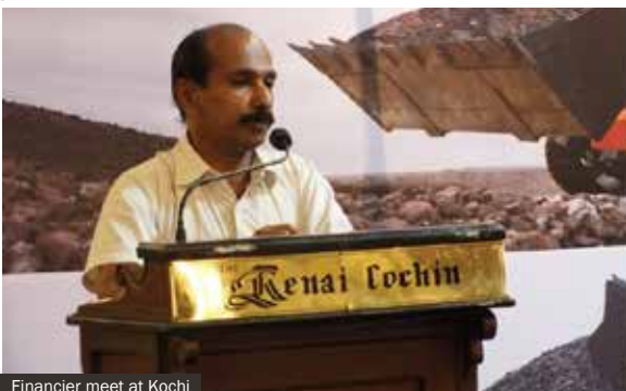
Financier meet at Kochi