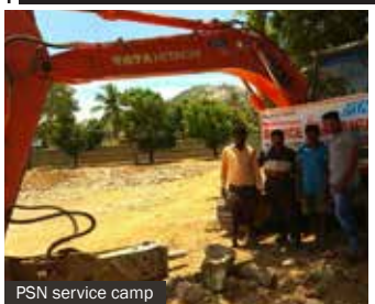
PSN service camp