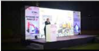
EX200 Super Plus launch at Indore