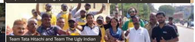
Team Tata Hitachi and Team The Ugly Indian