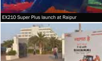
Shinrai launch at Raipur