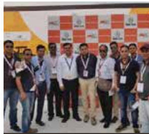
Tata Hitachi Stall IMME 2018