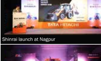
Shinrai launch at Nagpur