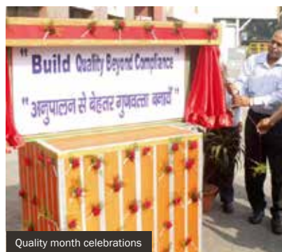
Quality month celebrations