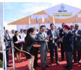
Inaguration of the Tata Hitachi booth