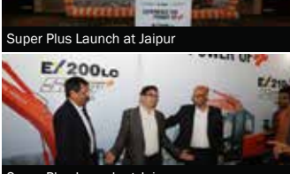
Super Plus Launch at Jaipur