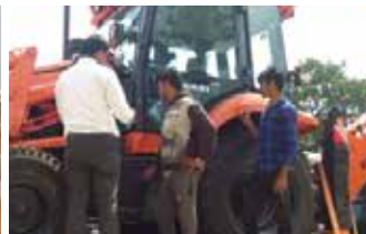
Shinrai roadshow at Bangalore