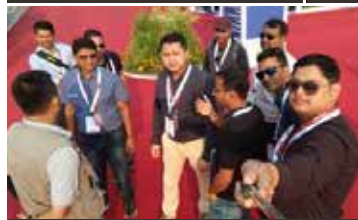
Roam around in IMME 2018