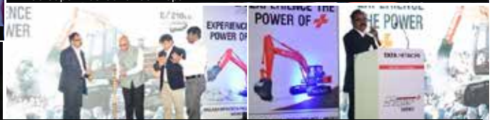
EX200 Super Plus launch at Indore