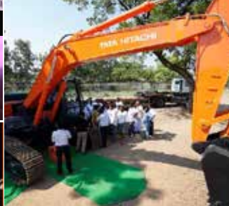
EX200 Super Plus Mini launch and key handover at Kurnool