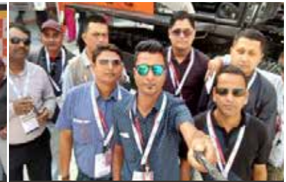
Machine walkaround in IMME 2018