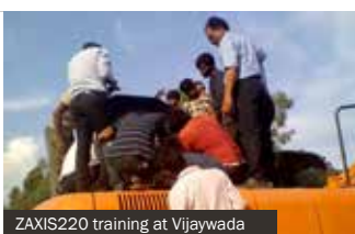
ZAXIS220 training at Vijaywada