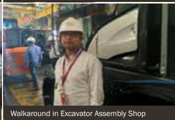
Walkaround in Excavator Assembly Shop