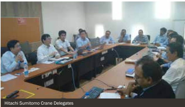
Hitachi Sumitomo Crane Delegates