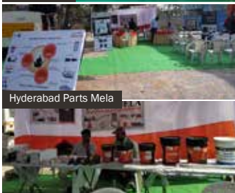
Hyderabad Parts Mela