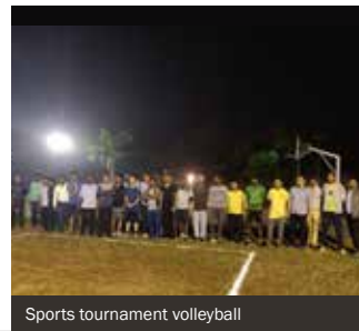
Sports tournament volleyball

• Sports Tournament - Badminton & Volleyball -With the sports season is at its full swing in Kharagpur Plant, activities kicked off with the commencement of the badminton tournament inaugurated by the Plant Head on December 5th. This was followed by a volleyball tournament on 19th December.