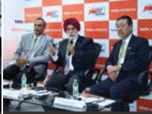
Press conference at the Tata Hitachi booth