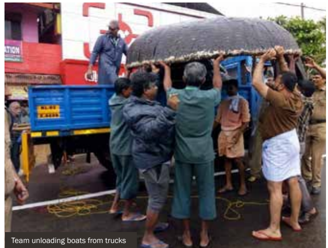
Team unloading boats from trucks

• Flood relief: The team of M/s Poabs - our Key Account customer with fleet of our equipment – went all out to help when floods devastated the "God's own Country". For National Disaster Response Force (NDRF) and the Indian Army, who were working day and night to rescue people from flood-hit remote locations, equipment and Tippers of Poabs were pressed into service to augment rescue operations. The Tippers of M/s Poabs carried various rescue materials like rubber boats, food packets and also refugees to rescue camps.