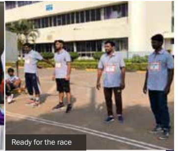
Ready for the race