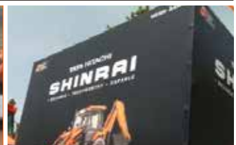
Shinrai roadshow at Bangalore