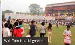
With Tata Hitachi goodies