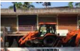
Shinrai roadshow at Kerala