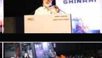
Shinrai launch at Nagpur