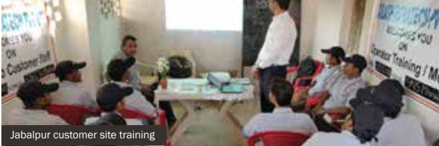
Jabalpur customer site training