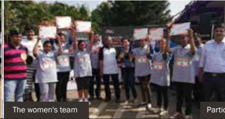
The women's team