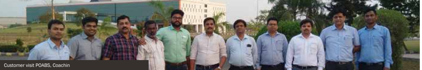
Customer visit POABS, Coachin