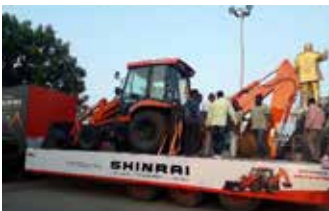
Shinrai road show and demo was held at Hyderabad