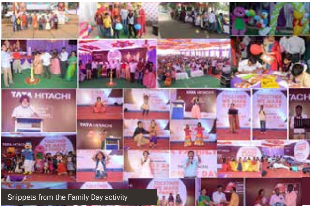
Snippets from the Family Day activity