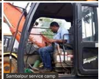
Sambalpur service camp