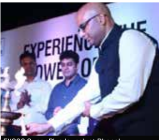
EX200 Super Plus launch at Bhopal