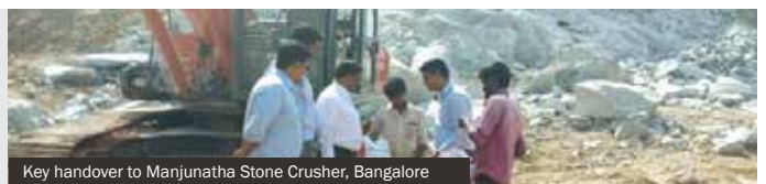
Key handover to Manjunatha Stone Crusher, Bangalore