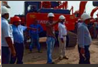
Machine PDI Area