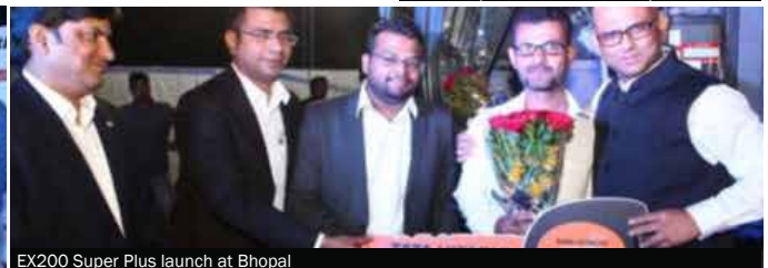
EX200 Super Plus launch at Bhopal