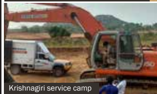
Krishnagiri service camp