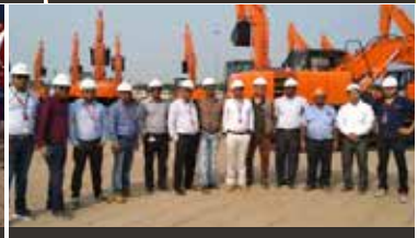
Finished Machine Despatch Section