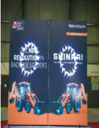
Shinrai launch at SSELLP, Nagpur