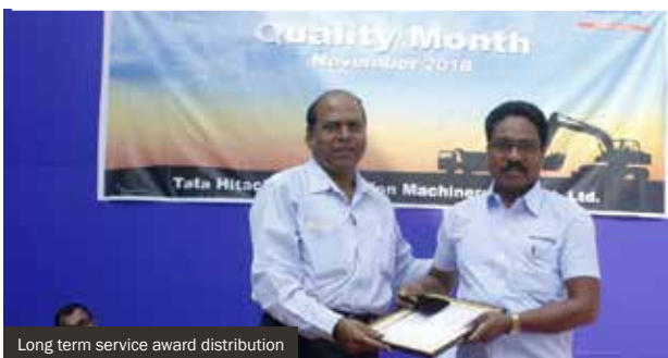
Long term service award distribution