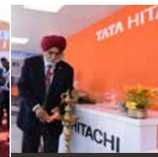
Lighting of the lamp in the Tata Hitachi booth