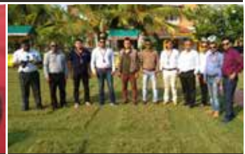
Guest arriving in Mandarmani