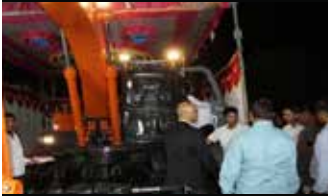
EX210 Super Plus launch at Makali, Bangalore