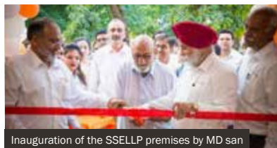
Inauguration of the SSELLP premises by MD san