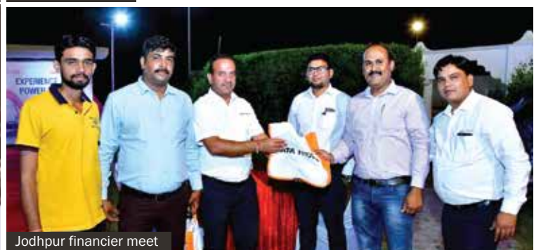
Jodhpur financier meet