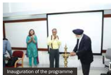
Inauguration of the programme