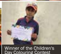
Winner of the Children's Day Colouring Contest