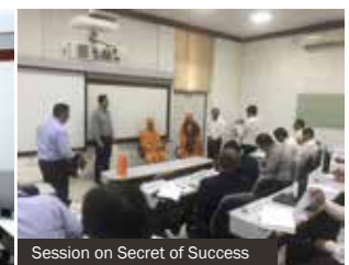
Session on Secret of Success