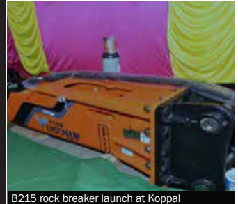
B215 rock breaker launch at Koppal