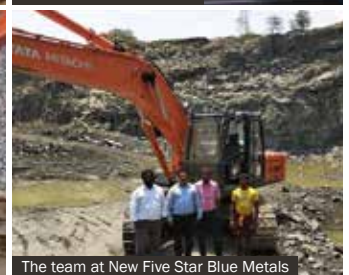
The team at New Five Star Blue Metals