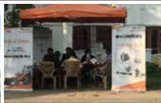
Shinrai roadshow at Bargur, Krishnagiri, Tamil Nadu