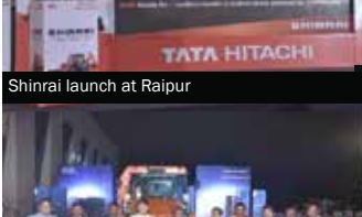
Shinrai launch at Raipur