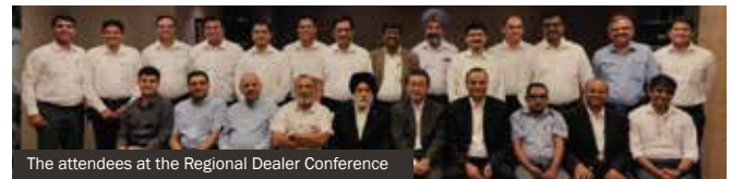
The attendees at the Regional Dealer Conference

The regional dealer conference was held in Delhi with all stakeholders.