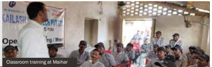
Classroom training at Maihar