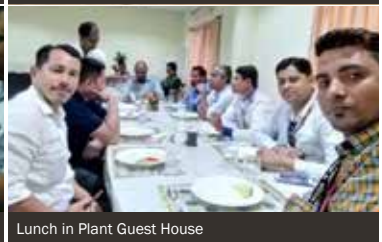
Lunch in Plant Guest House