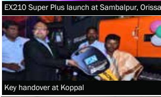
Key handover at Koppal