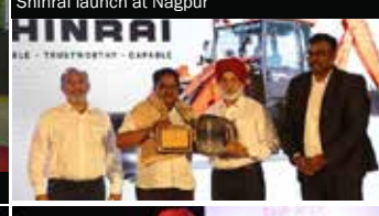
Shinrai launch at Nagpur