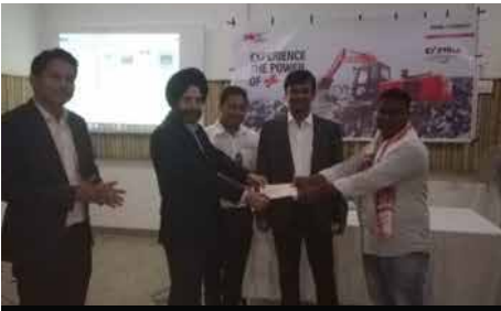
EX210 Super Plus launch at Barpeta