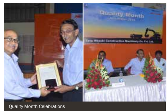
Quality Month Celebrations