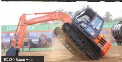
EX130 Super + demo