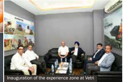
Inauguration of the experience zone at Vetri