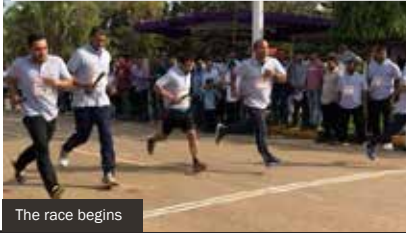
The race begins