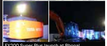
EX200 Super Plus launch at Bhopal