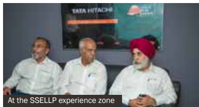
At the SSELLP experience zone