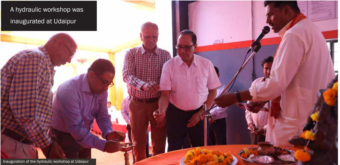
Inauguration of the hydraulic workshop at Udaipur

A hydraulic workshop was inaugurated at Udaipur