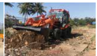
TUI partnership - Shinrai at work