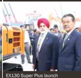
EX130 Super Plus launch