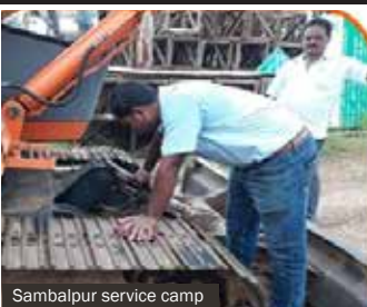
Sambalpur service camp