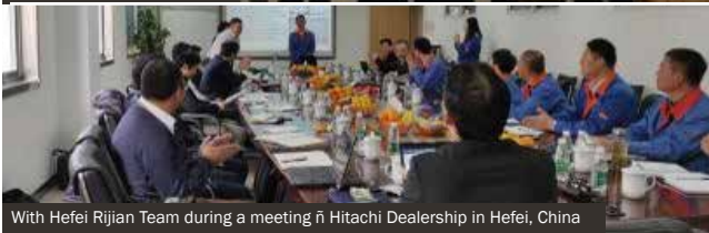
With Hefei Rijian Team during a meeting in Hitachi Dealership in Hefei, China