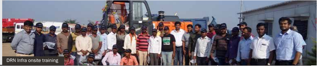
DRN Infra onsite training