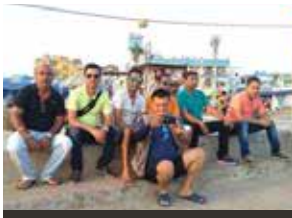
Local Sight Seeing in Mandarmani