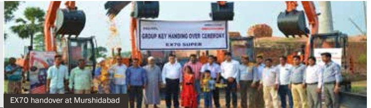
EX70 handover at Murshidabad