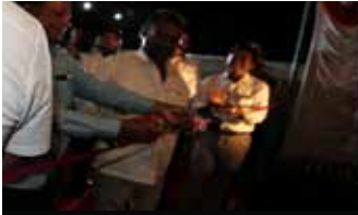
EX210 Super Plus launch at Makali, Bangalore