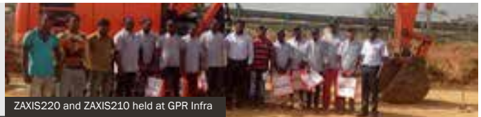
ZAXIS220 and ZAXIS210 held at GPR Infra