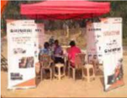
Shinrai roadshow at Hassan