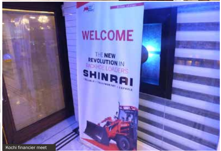
Kochi financier meet