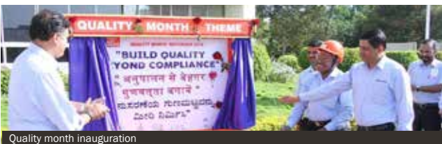
Quality month inauguration