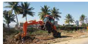
TUI partnership cleaning up the garbage

• Partnership with The Ugly Indian in Bangalore: Our all new backhoe loader Tata Hitachi Shinrai - in partnership with BBMP and The Ugly Indian – helped in cleaning up debris and garbage at Ejipura and Agara Lake.