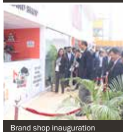
Brand shop inauguration