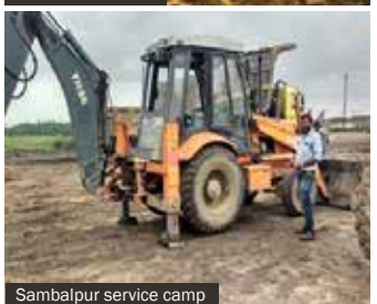
Sambalpur service camp