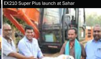
EX210 Super Plus launch at Sahar