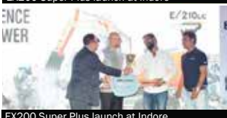
EX200 Super Plus launch at Indore