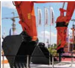
The Machines on display