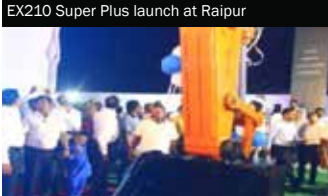
EX210 Super Plus launch at Raipur