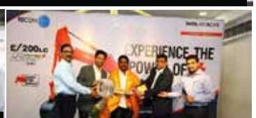
EX200 Super Plus mini launch and key handover at Hyderabad